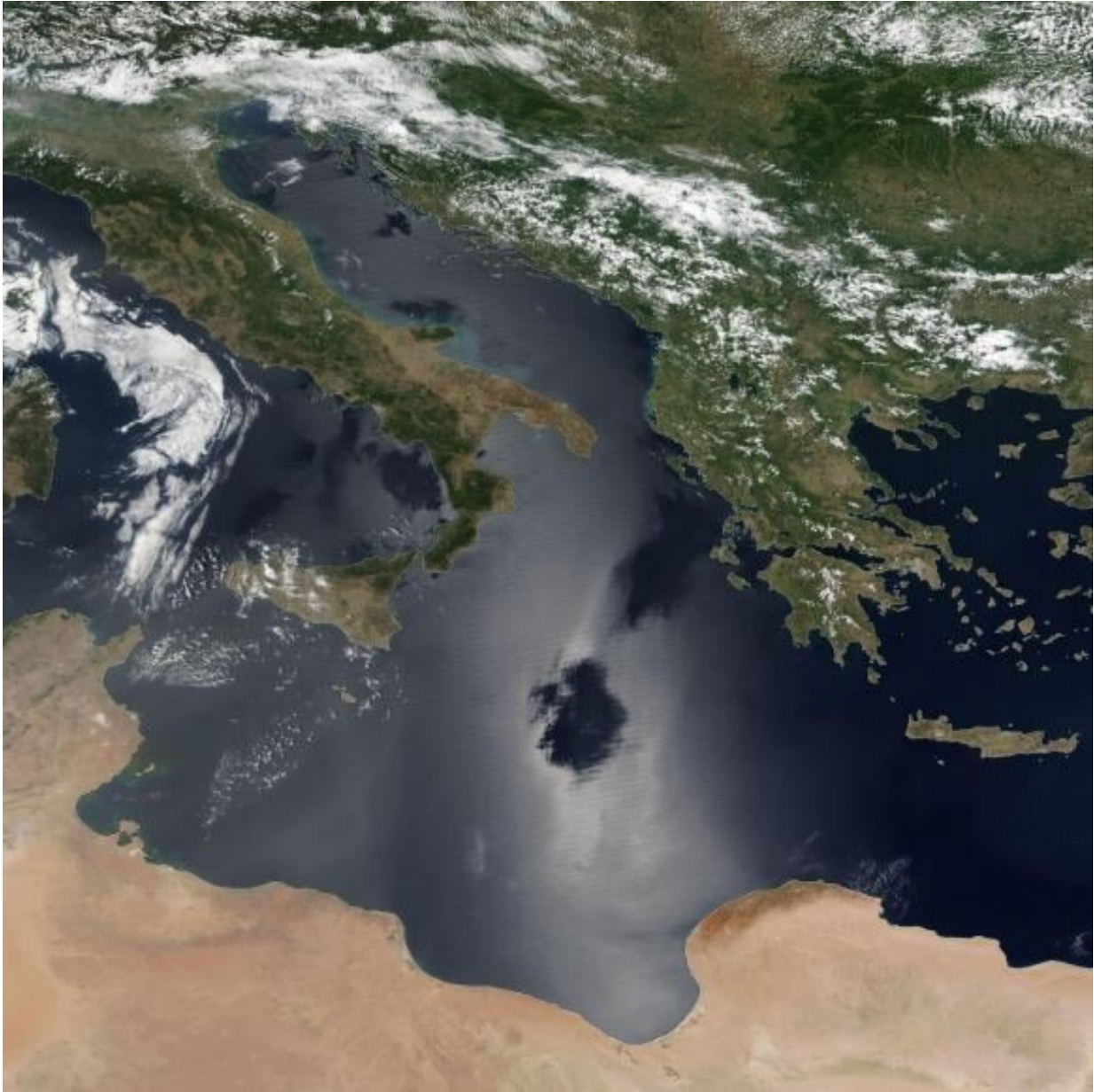
Example of sunlint from a satellite’s perspective – specifically in the Mediterranean.