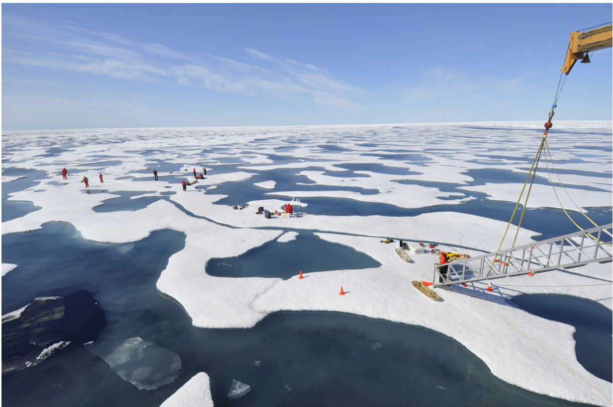
Field of melt ponds.

"Digging up research that occurred from the '50s and prior demonstrates that blooms, albeit not very large, were occurring under thick ice in the central Arctic," he explained. "I think this fact surprised many of us, as models had suggested this was not the case."