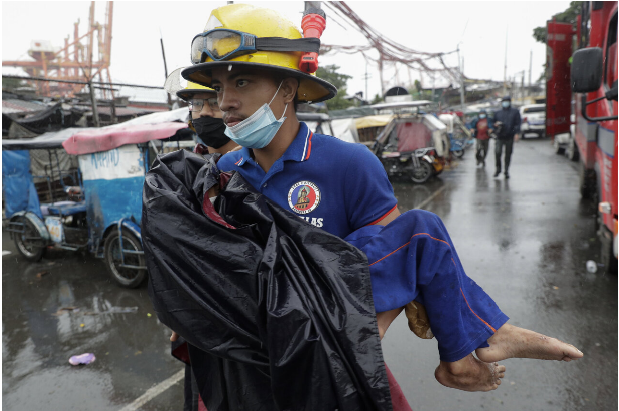
A rescuer carries a sick child as they evacuate residents living along a coastal community in Manila, Philippines on Sunday, Nov. 1, 2020. A super typhoon slammed into the eastern Philippines with ferocious winds early Sunday and about a million people have been evacuated in its projected path, including in the capital where the main international airport was ordered closed.