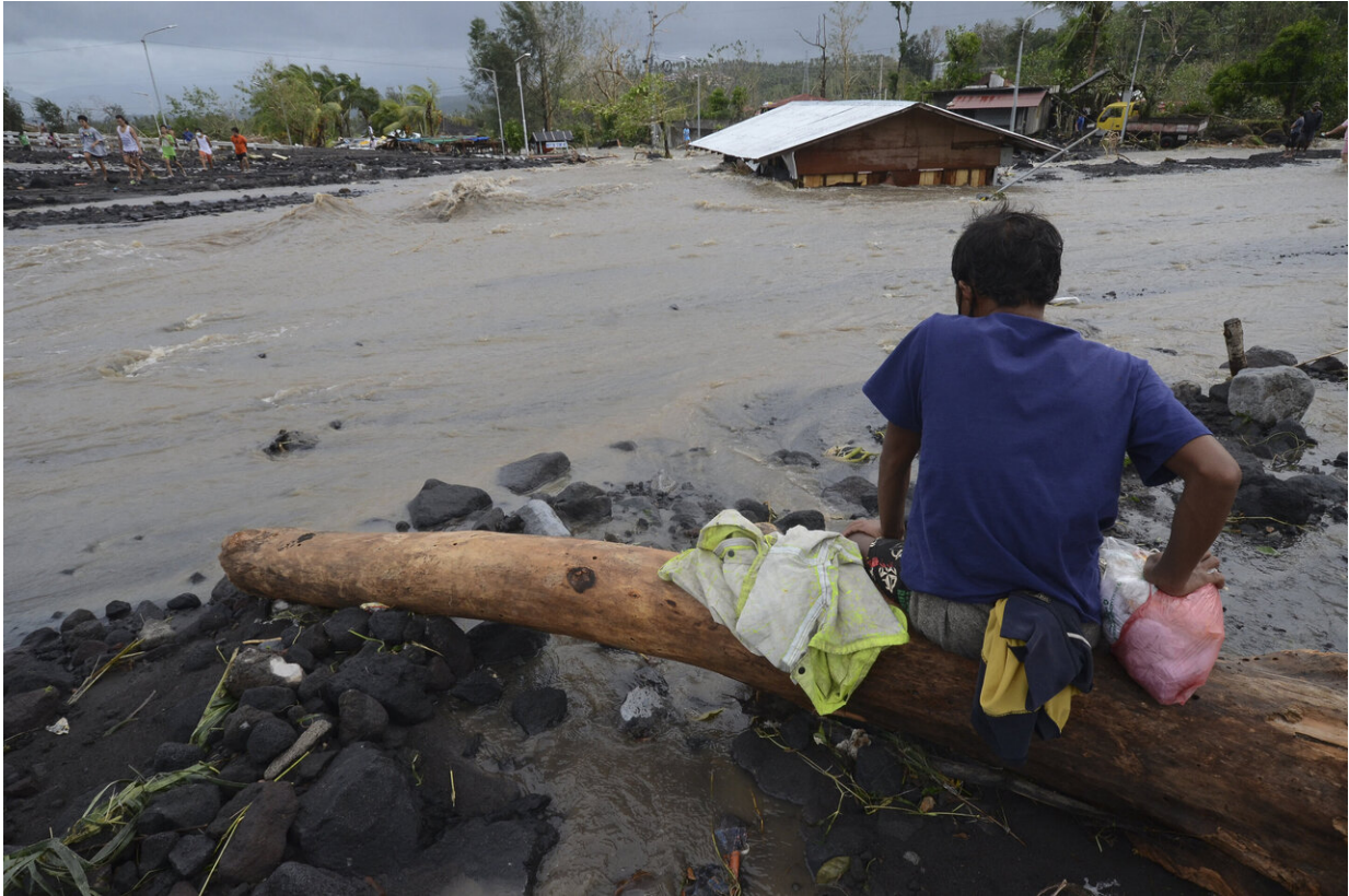
A man looks as floodwaters inundate an area as Typhoon Goni hit Daraga, Albay province, central Philippines, Sunday, Nov. 1, 2020. The super typhoon slammed into the eastern Philippines with ferocious winds early Sunday and about a million people have been evacuated in its projected path, including in the capital where the main international airport was ordered closed.