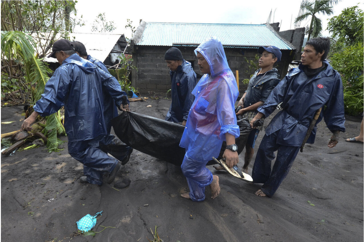
Rescuers carry the body of a man that drowned in floods as Typhoon Goni hit Guinobatan, Albay province, central Philippines, Sunday, Nov. 1, 2020. The super typhoon slammed into the eastern Philippines with ferocious winds early Sunday and about a million people have been evacuated in its projected path, including in the capital where the main international airport was ordered closed.