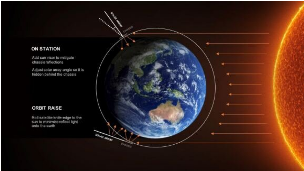
Illustration of Starlink orbits and their reflective qualities.

Naturally, SpaceX has emphasized that the risk of collision is very small. In their filings with the FCC in April of 2017, SpaceX addressed the possibility of collision risks assuming rates of "satellite failure resulting in the inability to perform collision avoidance procedures of 10, 5 and 1 percent." In response, the company indicated that even a 1% risk was unlikely, given the following specifications and guidelines: