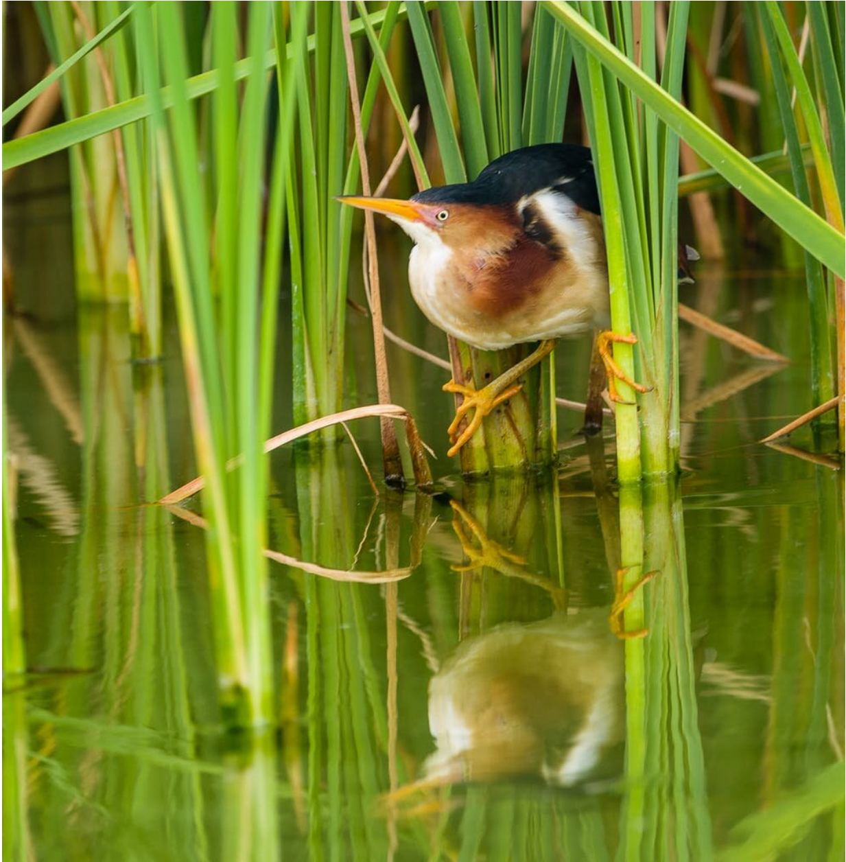
A least bittern, one of the smallest species of heron.

Marsh birds are adept at hiding in dense grasses, so it's more common to hear them than to see them. That's why we use a process known as a