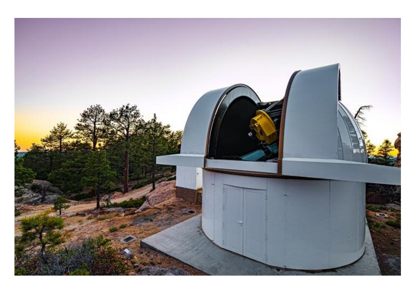
The SAINT-EX Observatory is a fully robotic facility hosting a 1-metre telescope based in Mexico.