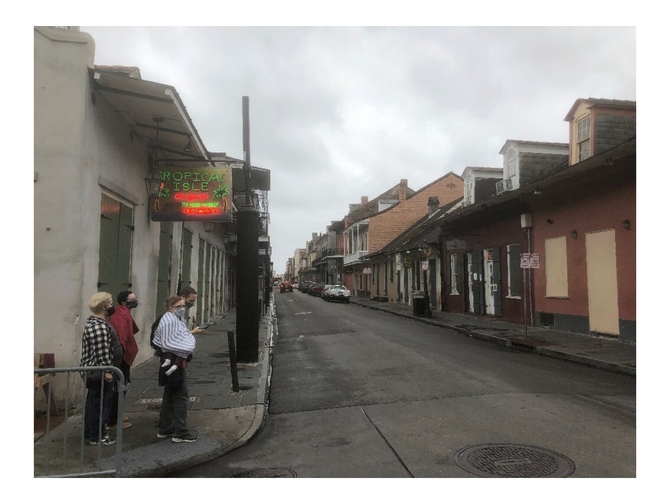
New Orleans's iconic French Quarter was largely deserted ahead of Hurricane Zeta's arrival

Edwards said in an earlier radio interview that nearly 500,000 were without power in the state, including 78 percent of New Orleans.