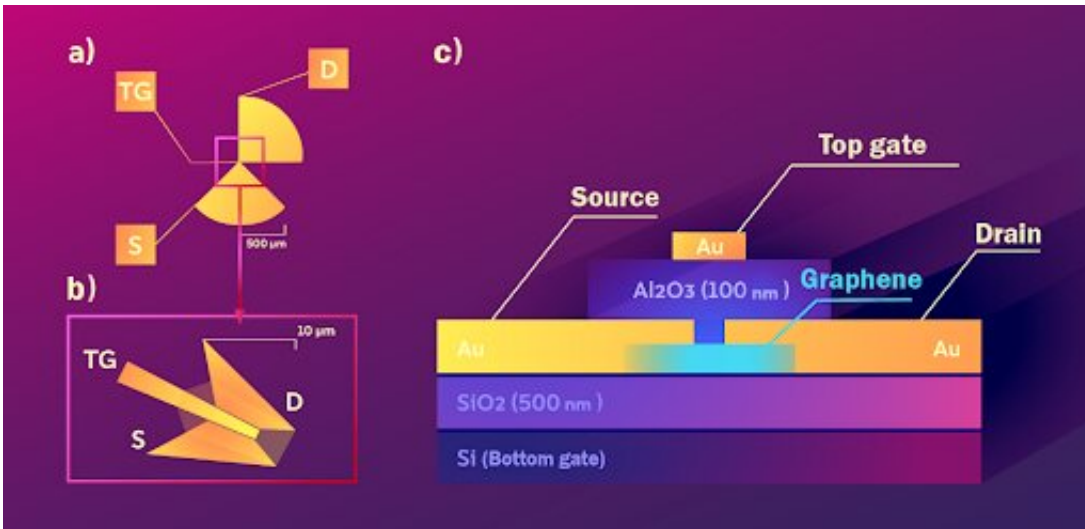
Figure 1. Inset (a) shows a top view of the device, with the sensitive region magnified in (b). The labels S, D, and TG denote the source, drain, and top gate. A side section of the detector is shown in (c). There are 1,000 nanometers (nm) in a micrometer ( \mu\text{m} ).

However, studies have so far not looked at the details of detector interaction with distinctly polarized T-rays. That said, devices sensitive to the waves' polarization would be of use in many applications. The study reported in this story experimentally demonstrated how detector response depends on the polarization of incident radiation. Its authors also explained why this is the case.