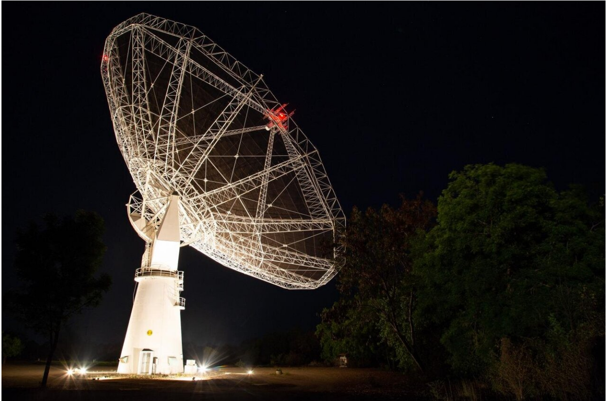
A GMRT Antenna at night.

study. "The observed decline in star formation activity can thus be explained by the exhaustion of the atomic hydrogen."