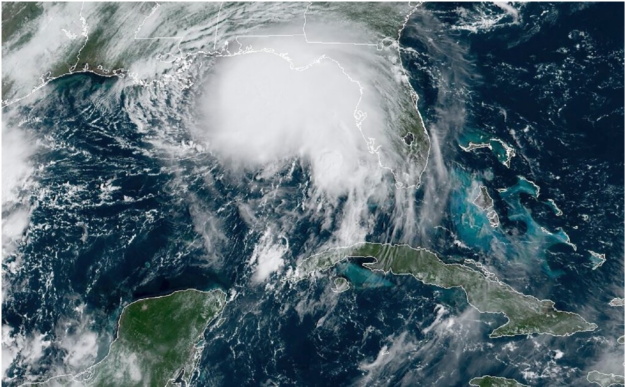
Hurricane Sally, seen off the Gulf of Mexico on September 14, 2020, at 1510 GMT

There have been so many tropical storms in the Atlantic this year that the UN's World Meteorological Organization, which names the tempests, is about to run out of names for only the second time in history.