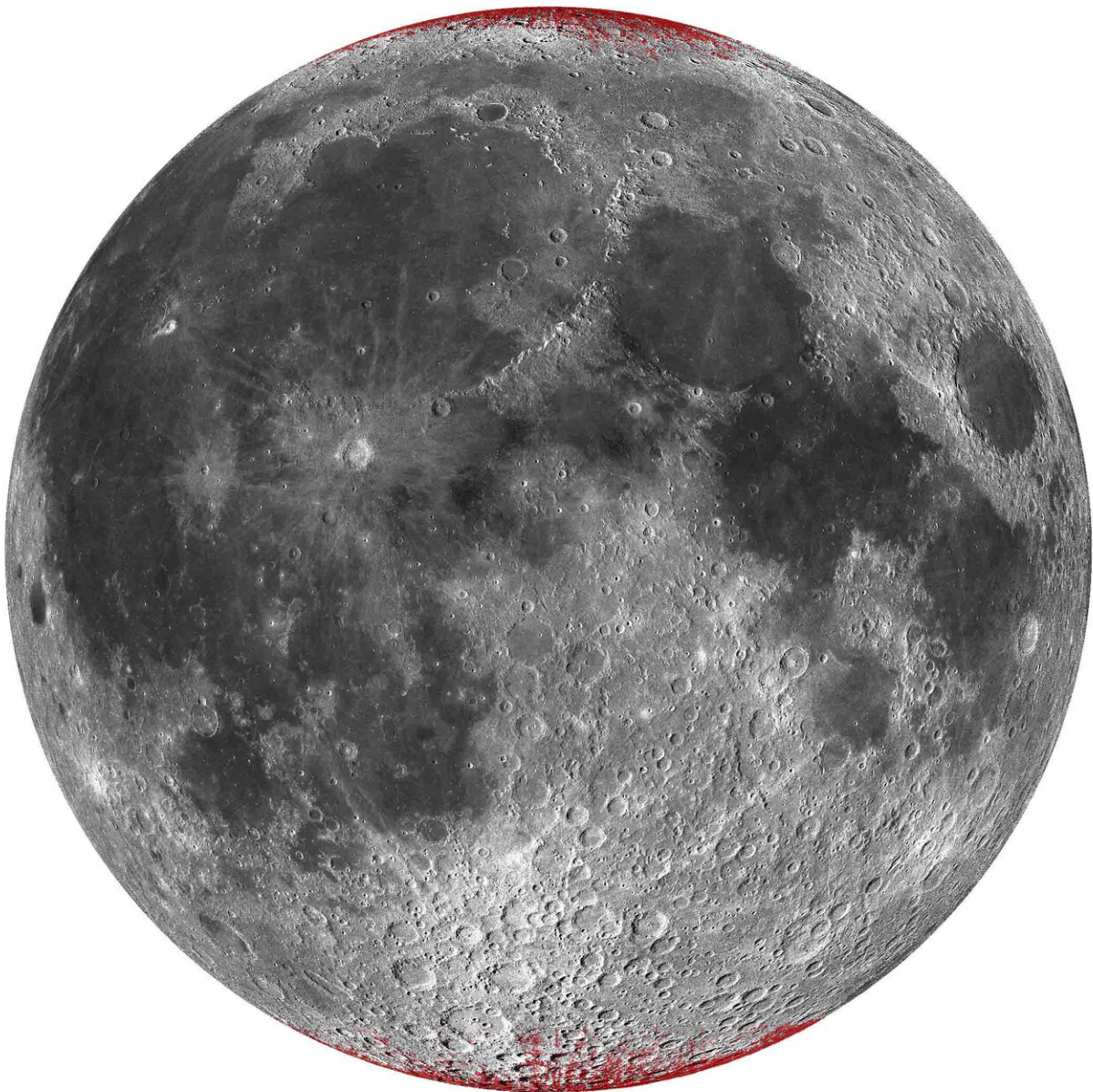
Exaggerated hematite exposures at the lunar poles.