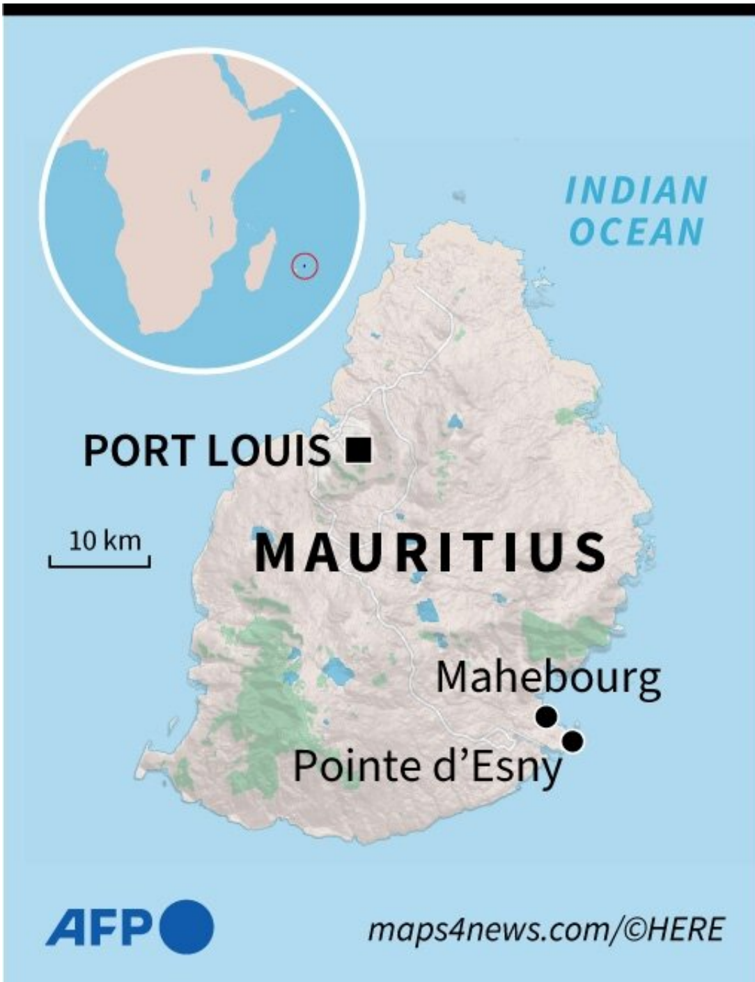
Map of Mauritius, locating Pointe d'Esny, where a cargo vessel struck a reef on July 25, and Mahebourg, one of the areas worst-hit by the ensuing fuel spill