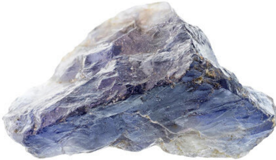
Cordierite crystal.

It is known that to experimentally realize a lattice of point electric dipoles is a challenging task. Usually physicists use the so-called interferometric optical lattice—a periodic structure of fields that is created as the result of laser beams interference. Ultracold atoms of materials to be studied are placed into the lattice points.