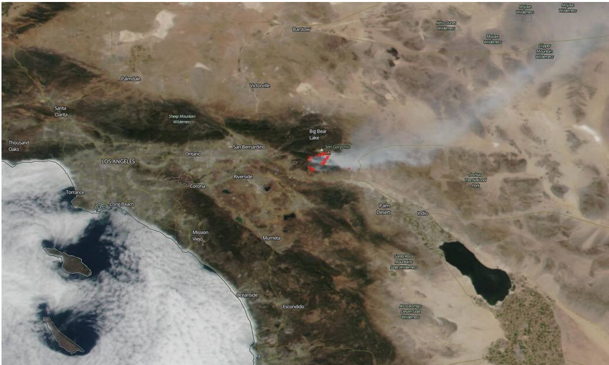
Image was taken by NOAA/NASA's Suomi NPP satellite on Aug. 02, 2020 in visible light.

NASA's satellites were working overtime as they snapped pictures of the large Apple Fire in Banning Canyon near San Bernardino, California on Aug. 02, 2020. This fire began on July 31, 2020 and the cause of the fire is still under investigation. To date the fire has consumed 20,516 acres