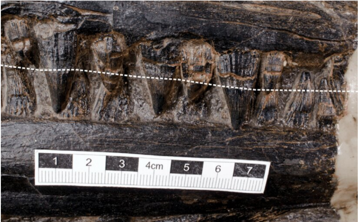
The ichthyosaur's teeth, with the broken white line indicating the approximate gum line of the upper jaw.

While the researchers now know that the ichthyosaur could eat animals as large as the thalattosaur, they don't know if it killed this individual, or simply scavenged it. "Nobody was there filming it," says Motani. However, there is reason to believe this was not a case of scavenging: modern marine decomposition studies suggest that if left to decay, the thalattosaur's limbs would disintegrate and detach before the tail. Instead, the researchers found the opposite in these fossils. The thalattosaur's limbs were at least partially attached to its body in the stomach, while a disconnected tail was found many yards away, leading the researchers to believe it was ripped off and left behind by a predator like the ichthyosaur.