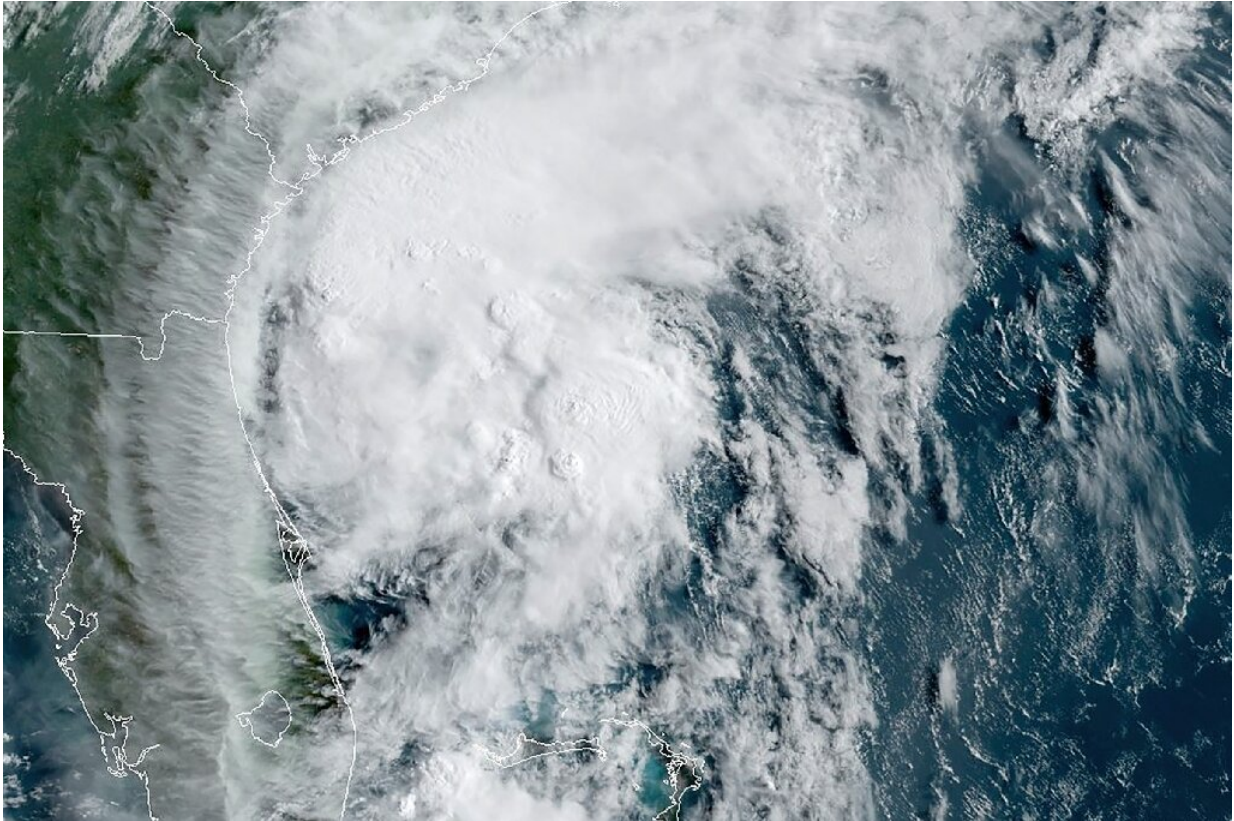
Tropical storm Isaias off the US southeast coast in the Atlantic Ocean

"You pack your emergency kit, follow local evacuation orders, stay in a safe place and never drive through flooded roadways.