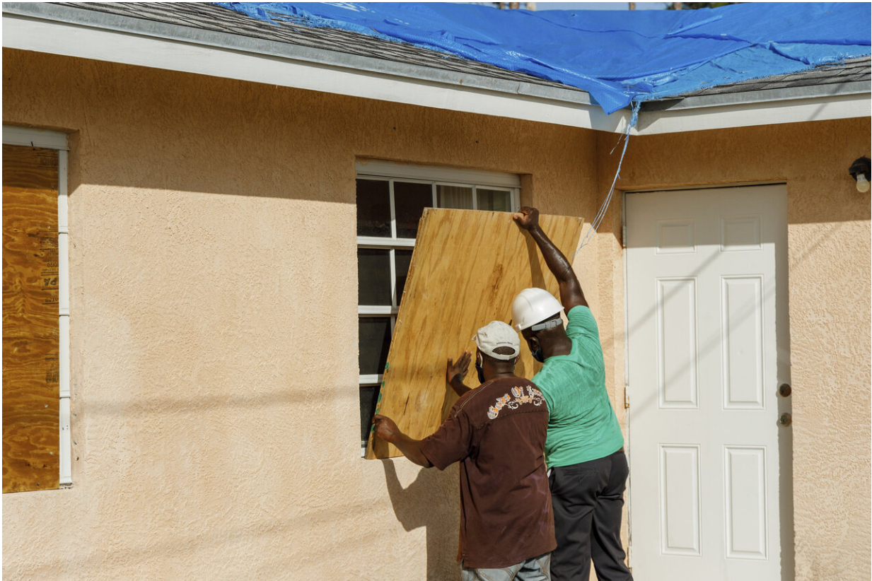
Residents cover a window with plywood in preparation for the arrival of Hurricane Isaias, in the Heritage neighborhood of Freeport, Grand Bahama, Bahamas, Friday, July 31, 2020.