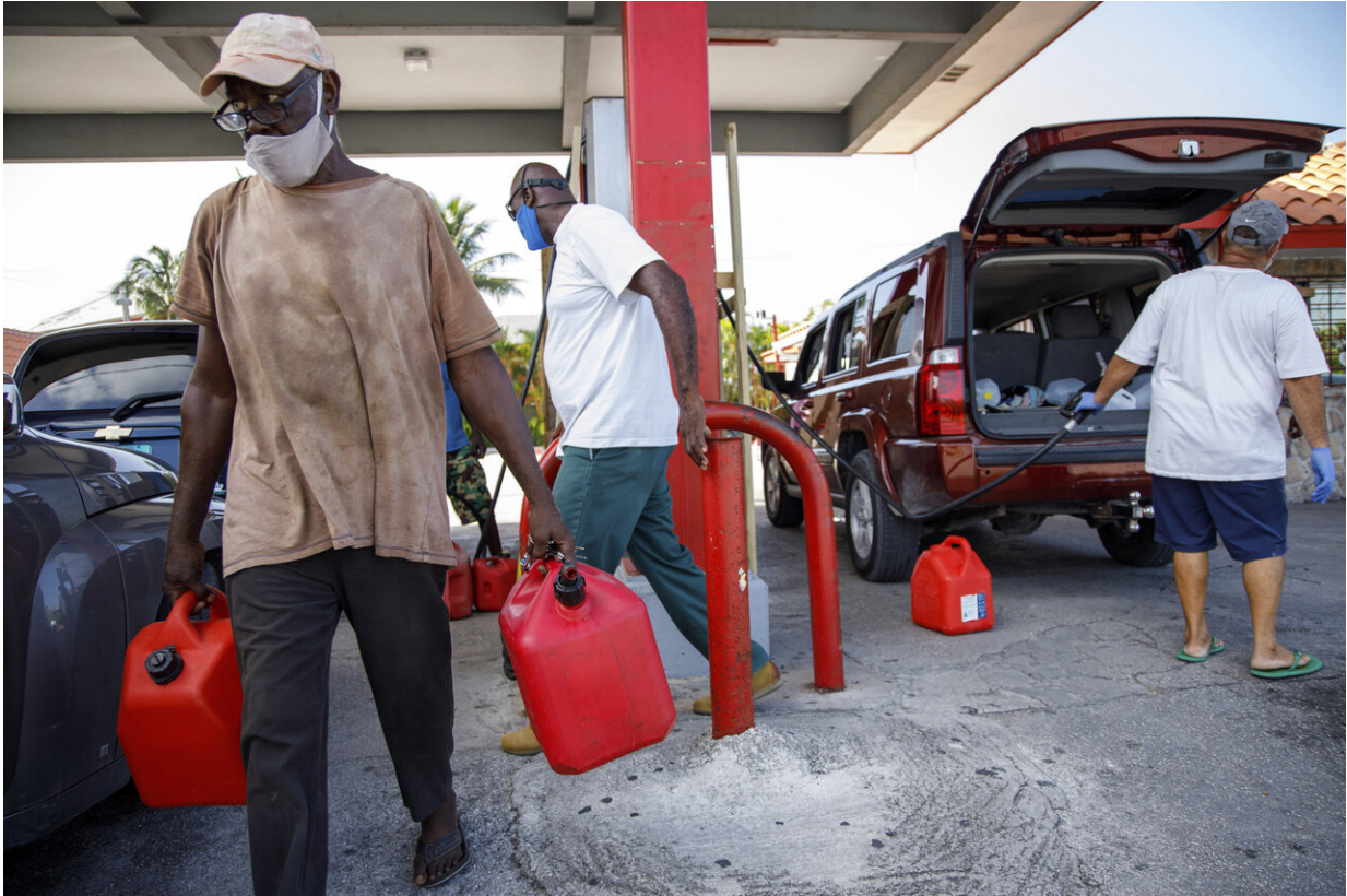
A resident walks with containers filled with gasoline at Cooper's gas station before the arrival of Hurricane Isaias in Freeport, Grand Bahama, Bahamas, Friday, July 31, 2020.