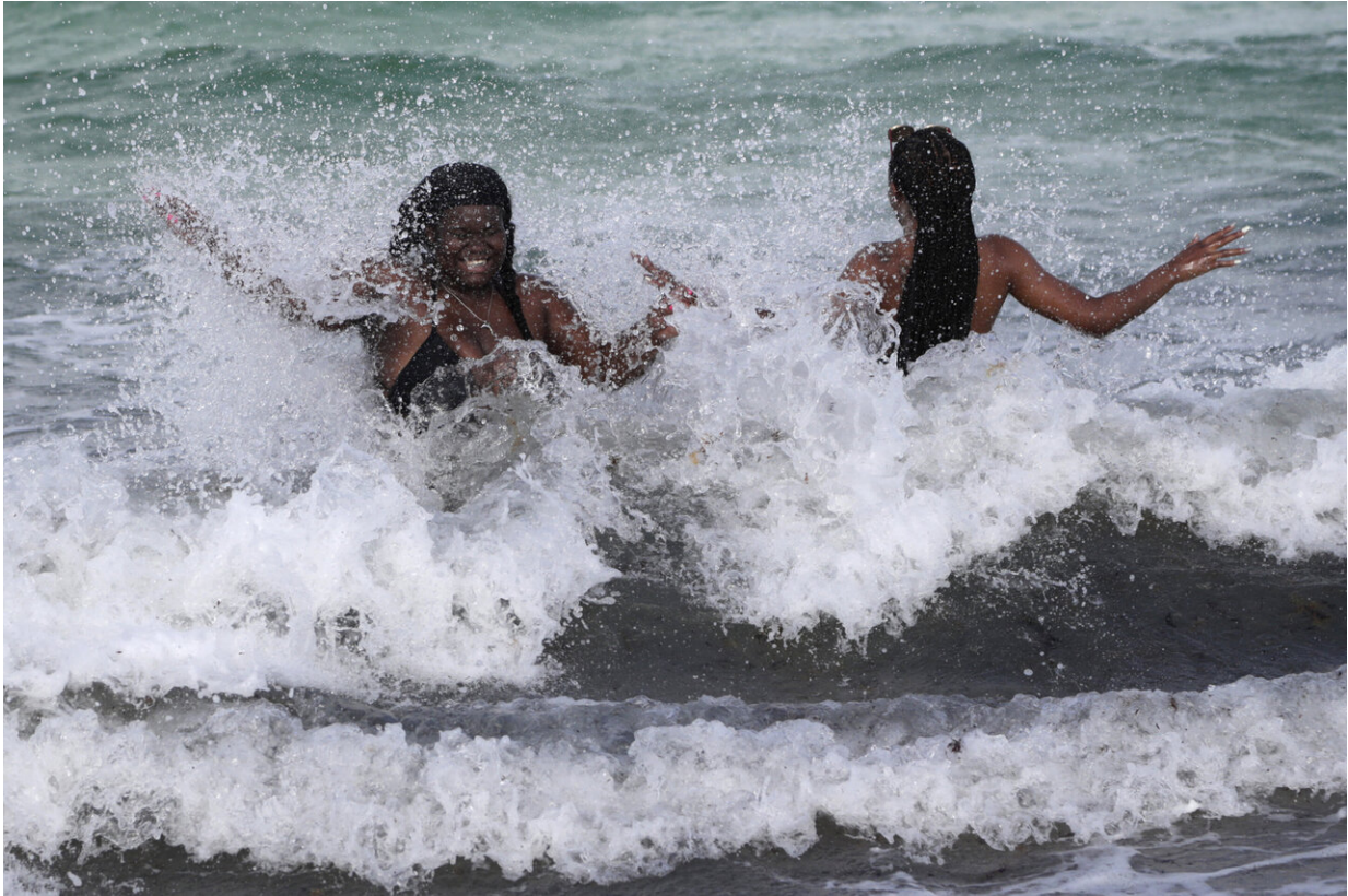
Women enjoy the waves from a high surf, Friday, July 31, 2020, in Miami Beach, Fla. Forecasters declared a hurricane warning for parts of the Florida coast Friday as Hurricane Isaias drenched the Bahamas on track for the U.S. East Coast.