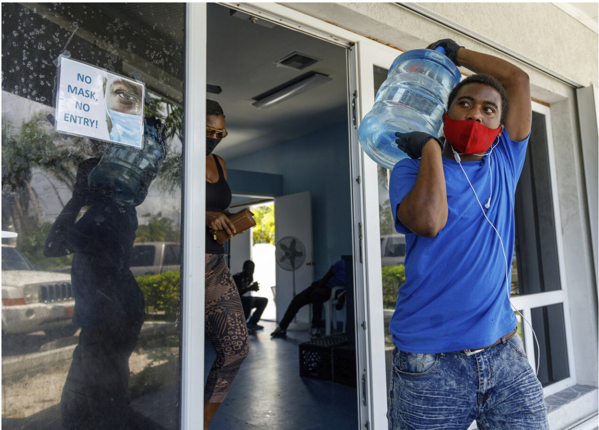
A man carries drinking water for a customer at a water depot store before the arrival of Hurricane Isaias in Freeport, Grand Bahama, Bahamas, Friday, July 31, 2020.

Prime Minister Hubert Minnis relaxed a coronavirus lockdown as a result of the impending storm, but imposed a 10 p.m. to 5 a.m. curfew. He said supermarkets, pharmacies, gas stations and hardware stores would be allowed to be open as long as weather permitted.