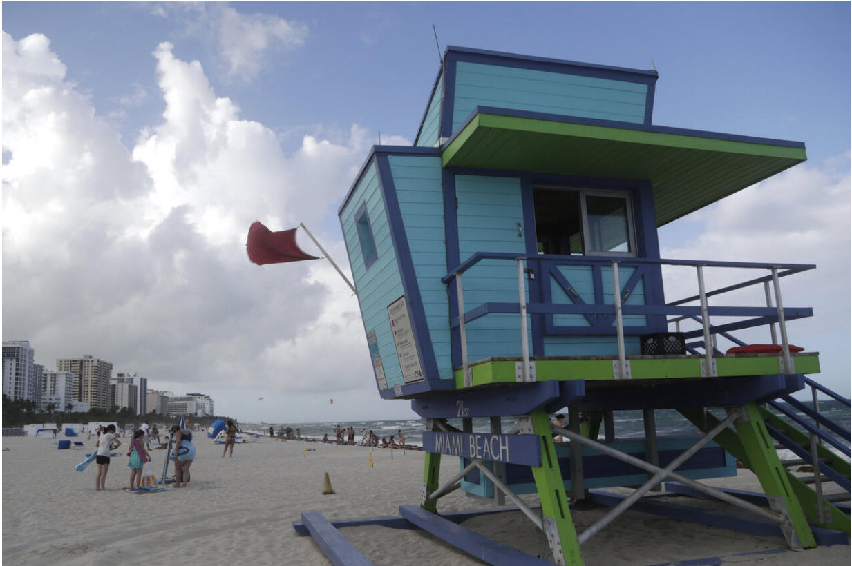
A red flag flies from a lifeguard station indicating high surf, Friday, July 31, 2020, in Miami Beach, Fla. Forecasters declared a hurricane warning for parts of the Florida coast Friday as Hurricane Isaias drenched the Bahamas on track for the U.S. East Coast.