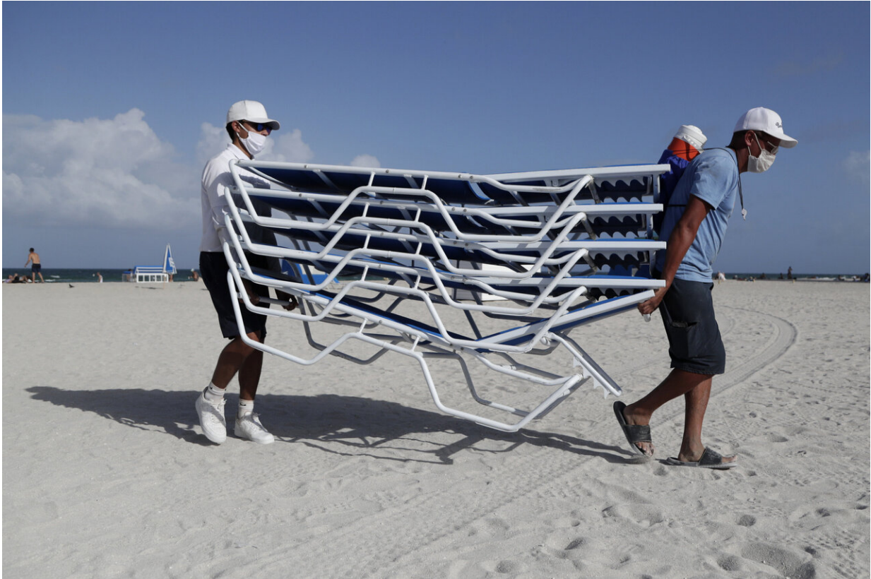
Workers remove chairs from the beach in preparation for Hurricane Isaias, Friday, July 31, 2020, in Miami Beach, Fla. Forecasters declared a hurricane warning for parts of the Florida coast Friday as Hurricane Isaias drenched the Bahamas on track for the U.S. East Coast.