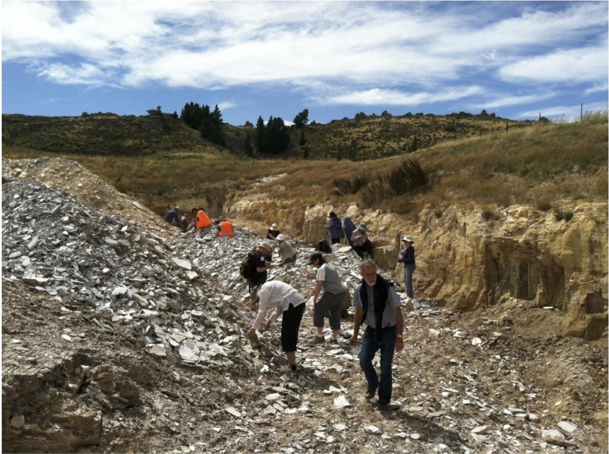
Paleobotanists prospecting New Zealand's Foulden Maar for fossils, 2013.

This might seem like good news, but the reality is more complex. Increased \text{CO}_2 absorption will not come close to compensating for what humans are pouring into the air. Not all plants can take advantage, and among those who do, the results can vary depending on temperature and availability of water or nutrients. And, there is evidence that when some major crops photosynthesize more rapidly, they absorb relatively less calcium, iron, zinc and other minerals vital for human nutrition. Because much of today's plant life evolved in a temperate, low- \text{CO}_2 world, some natural and agricultural ecosystems could be upended by higher \text{CO}_2