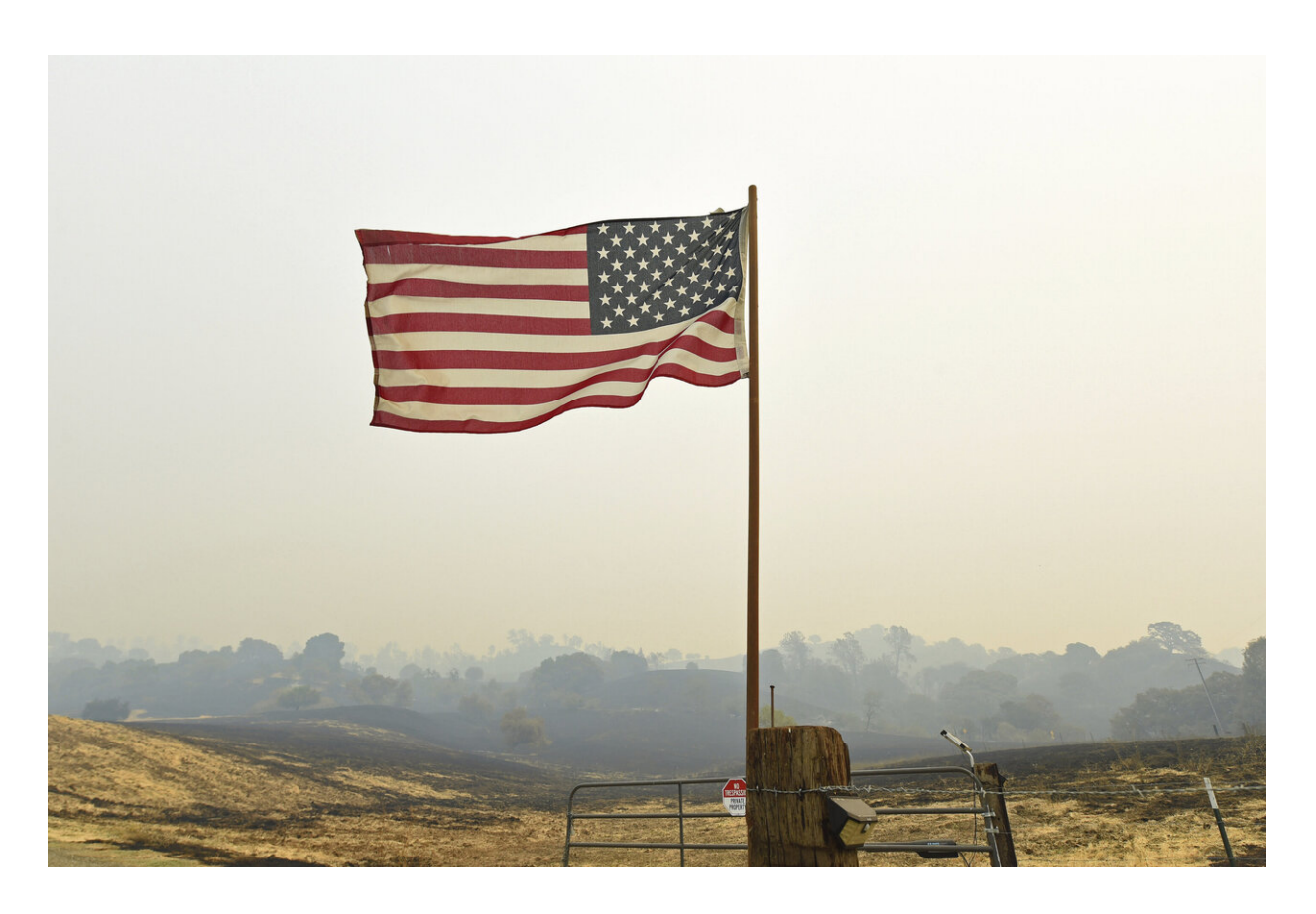
A U.S. flag on Cantelow Road waves in the wind after surviving a fire in Vacaville, Calif., on Thursday, Aug. 20, 2020. The LNU Lightning Complex fires began in Napa and Sonoma counties and have traveled into Solano, Lake and Yolo counties while burning more than 200 square miles.