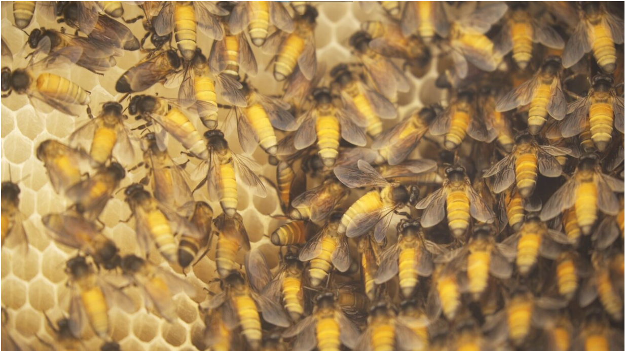
Photos of Giant Asian Honey bee ( Apis dorsata) colonies in Bengaluru, India.