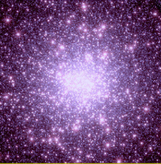
See to the cores of globular clusters