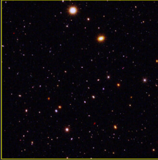
Capture a million distant galaxies in each image