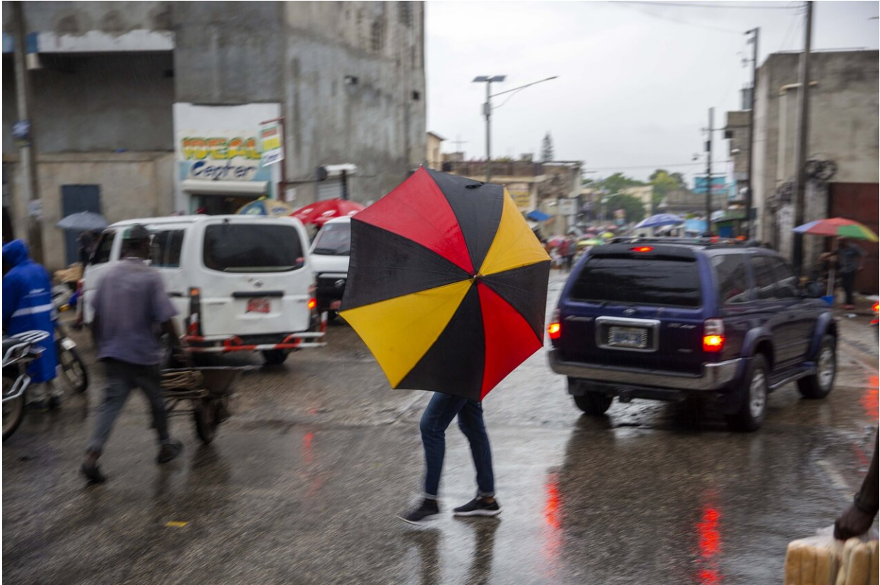
Pedestrians venture out into the rain brought by the outer bands of Hurricane Isaias in the Petionville district of Port-au-Prince, Haiti, early Friday, July 31, 2020. Isaias kept on a path early Friday toward the U.S. East Coast as it approached the Bahamas.