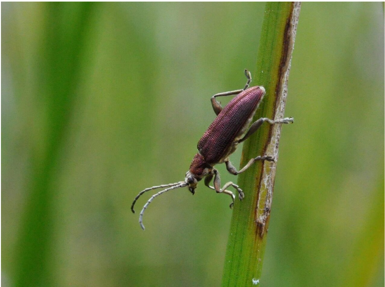
The reed beetle species Donacia thalassina feeds mainly on sedges.

evolution, the pectinases have disappeared from the symbiont genomes in four independent beetle lineages. Beetles that do not obtain pectinases through their symbiont are specialized to live on grasses and sedges, plants with low amounts of pectin. "These beetles have changed their food plant preferences. And because grasses and sedges only have small amounts of pectin in the cell wall, the pectinases provided by the symbionts were no longer useful and got subsequently lost," said Kaltenpoth. Beetles that continue to feed on water lilies, grass rush, or pondweed still have at least one pectinase.