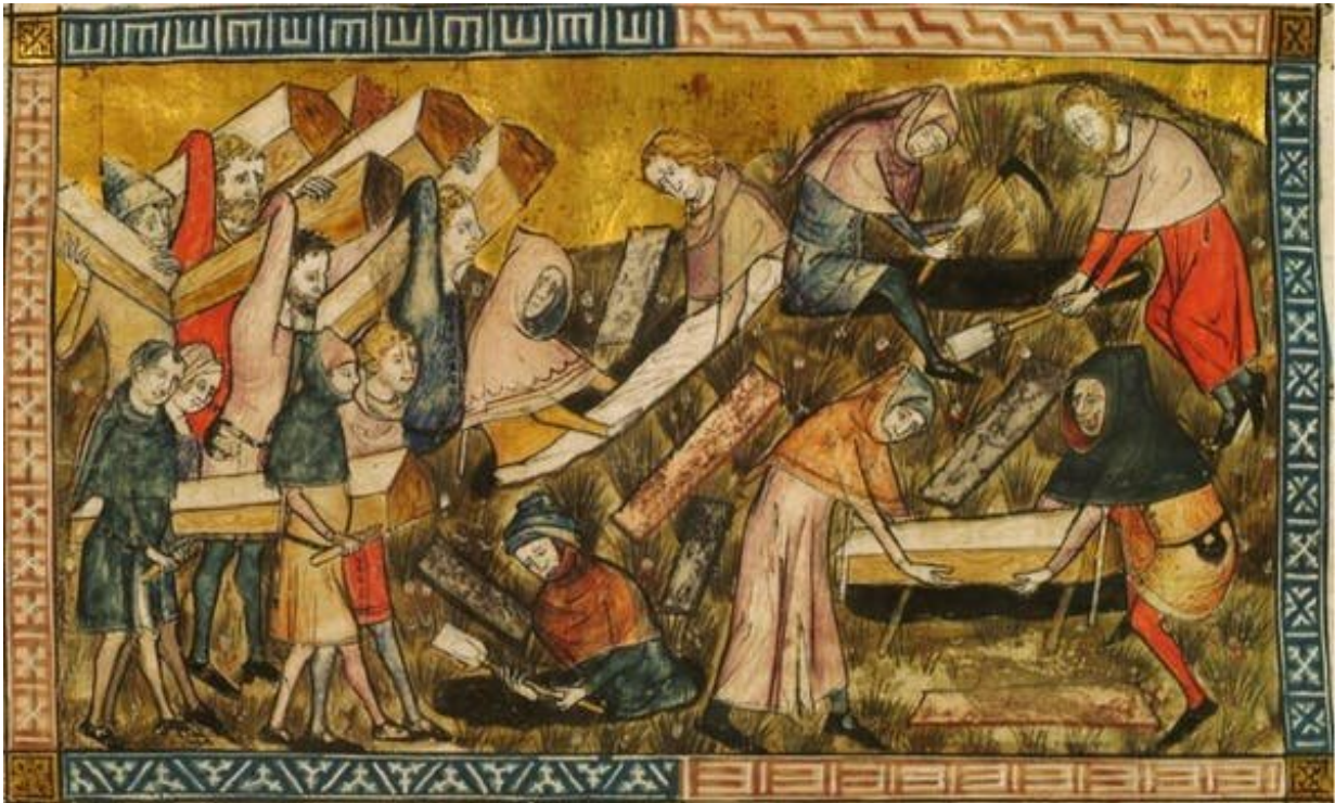
The people of Tournai bury victims of the Black Death, c.1353.

The final link in the chain is the delivery companies themselves: UPS, FedEx, Amazon Logistics (again), as well as food delivery from Just Eat and Deliveroo. Through their business models are different, their platforms now dominate the movements of products of all kinds, whether your new Toshiba branded Amazon Fire TV, or your stuffed crust from Pizza Hut (a subsidiary of Yum! Brands, which also owns KFC, Taco Bell and others).