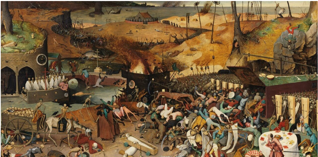
The Triumph of Death, Pieter Bruegel the Elder, 1562.