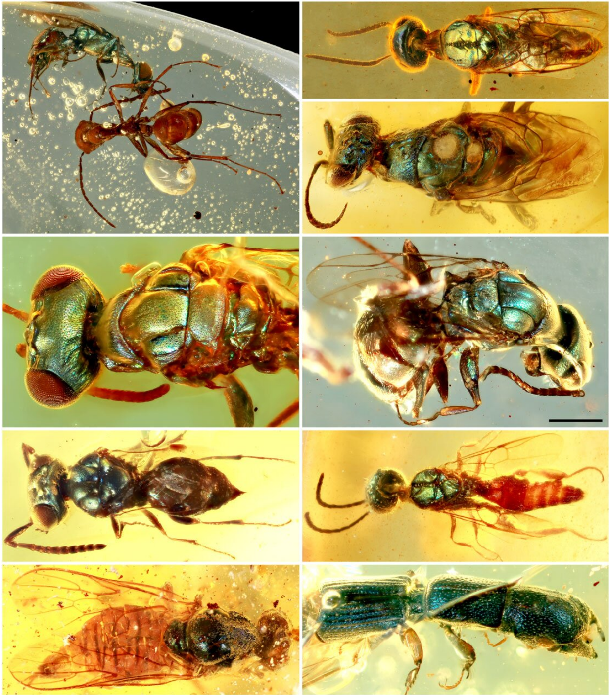
Diverse structural-colored insects in mid-Cretaceous amber from northern Myanmar.