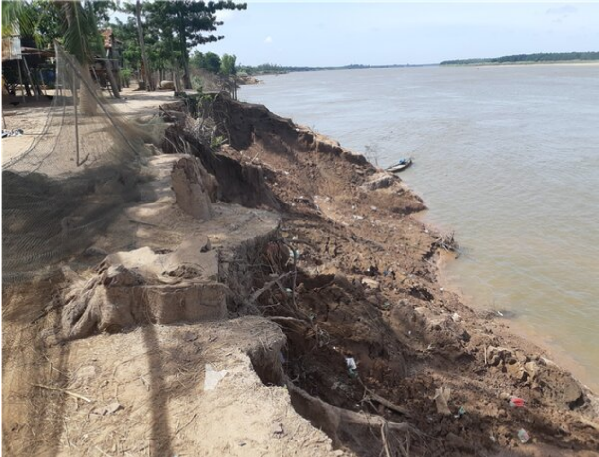
Riverbank erosion along the Mekong River, Cambodia.

To further mobilize a sand agenda, researchers and campaigners could focus on narratives that draw on the climate crisis or other ecological dimensions , such as directing attention to how sand dredging is linked to landslides and poorer water quality, or how sand infill leads to the loss of wetland habitat .