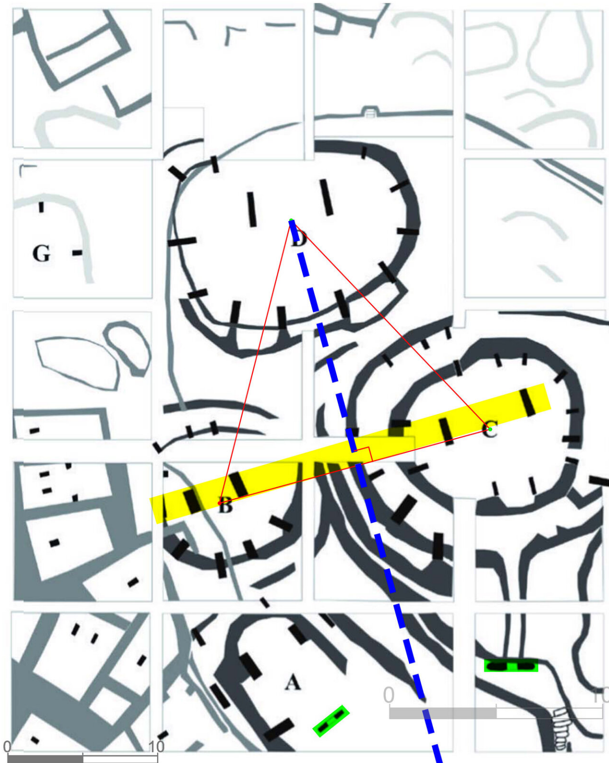
Geometric pattern underlying the architectural planning of a complex at Göbekli Tepe. A diagram superimposed over the schematic plan. Credit: Gil