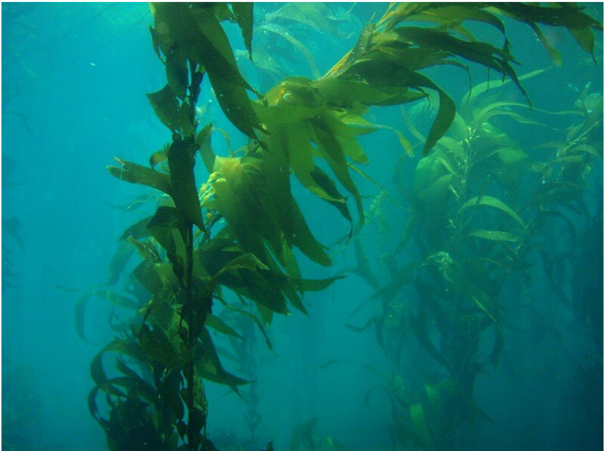
Giant kelp ( Macrocystis pyrifera). California, Channel Islands NMS.