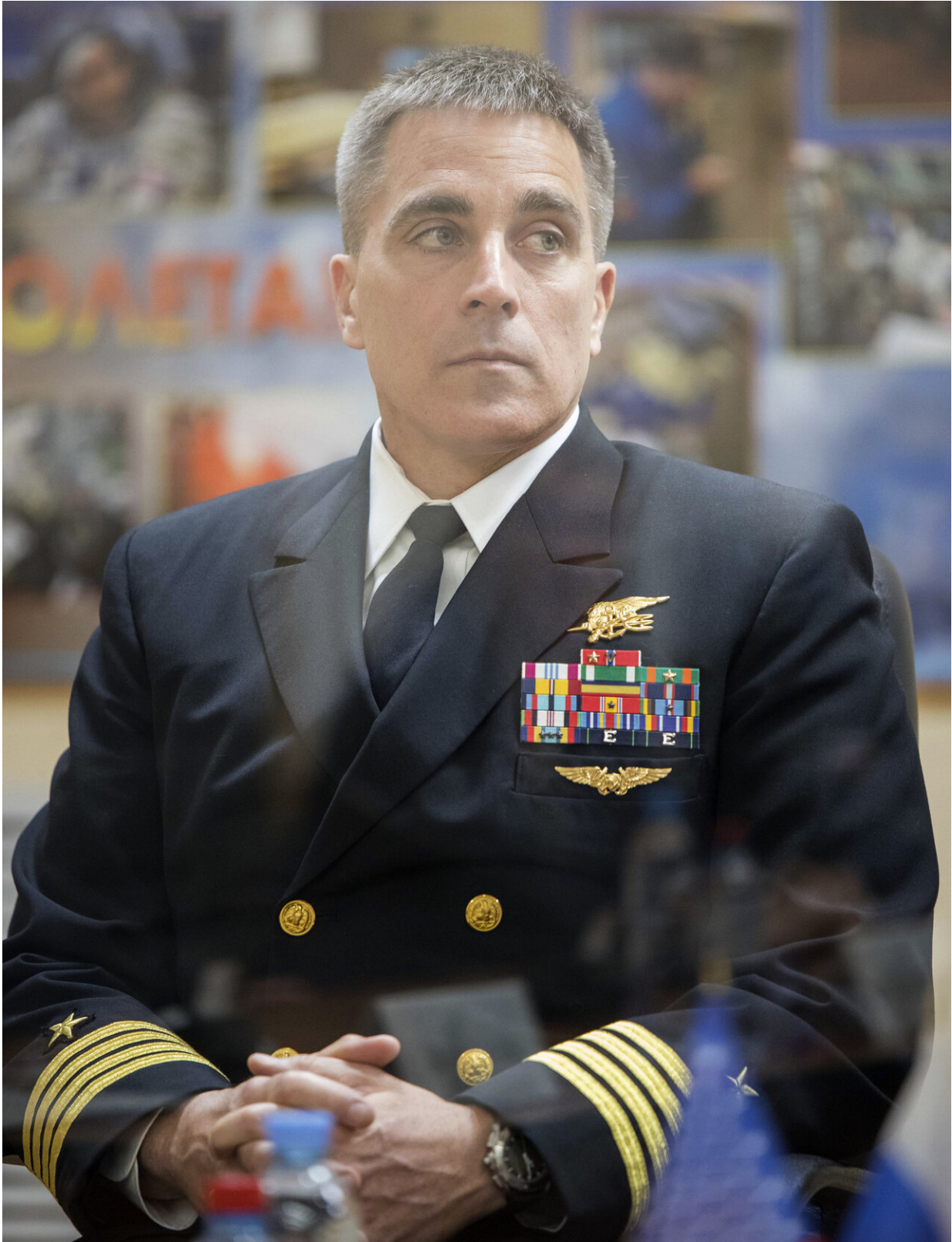
U.S. astronaut Chris Cassidy