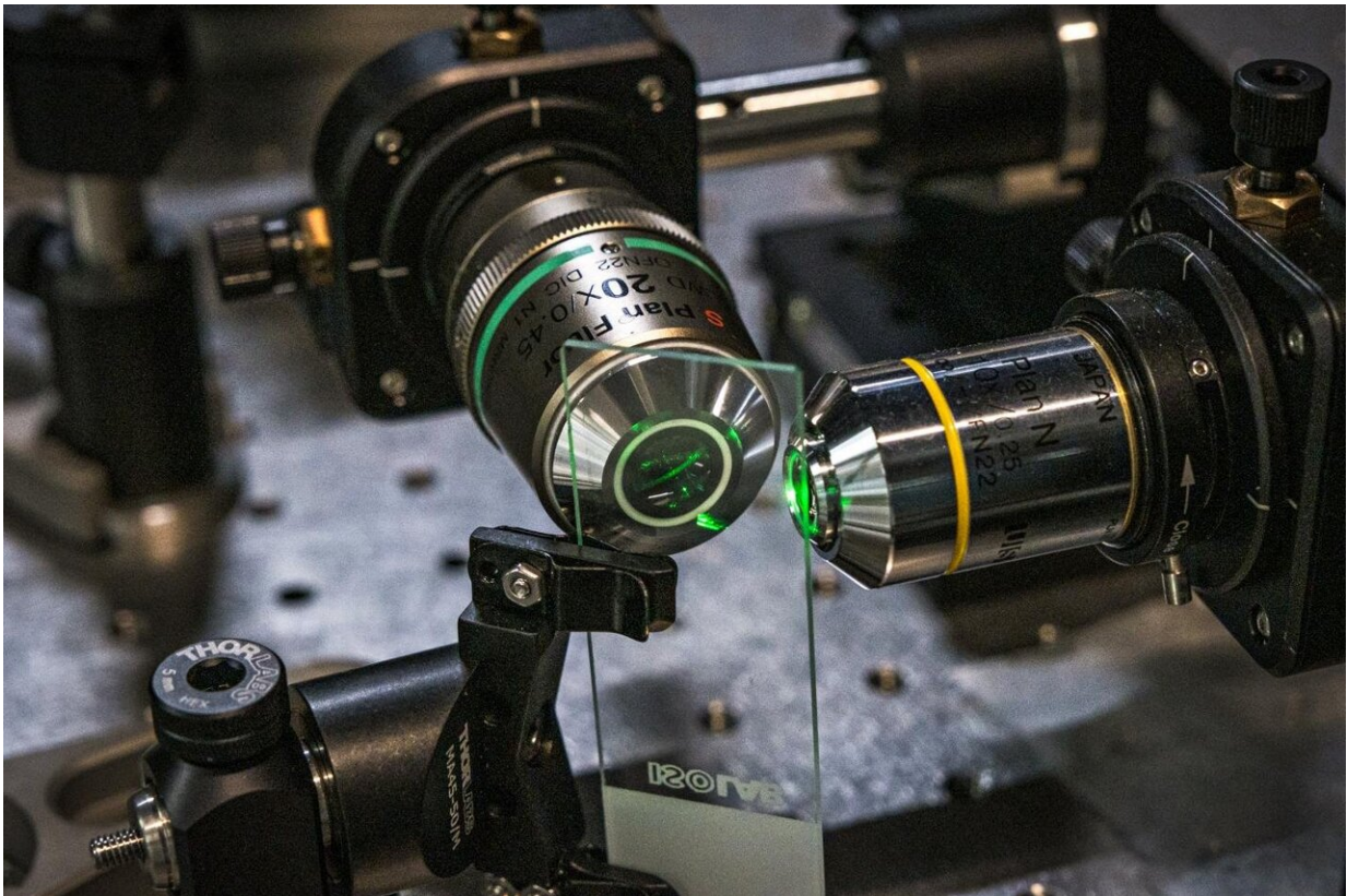
Coded Light-sheet Array Microscopy (CLAM)

Moreover, these platforms often quickly exhaust the limited fluorescence "budget"—a fundamental constraint that fluorescent light can only be generated upon illumination for a limited period before it permanently fades out in a process called "photo-bleaching," which sets a limit to how many image acquisitions can be performed on a sample.