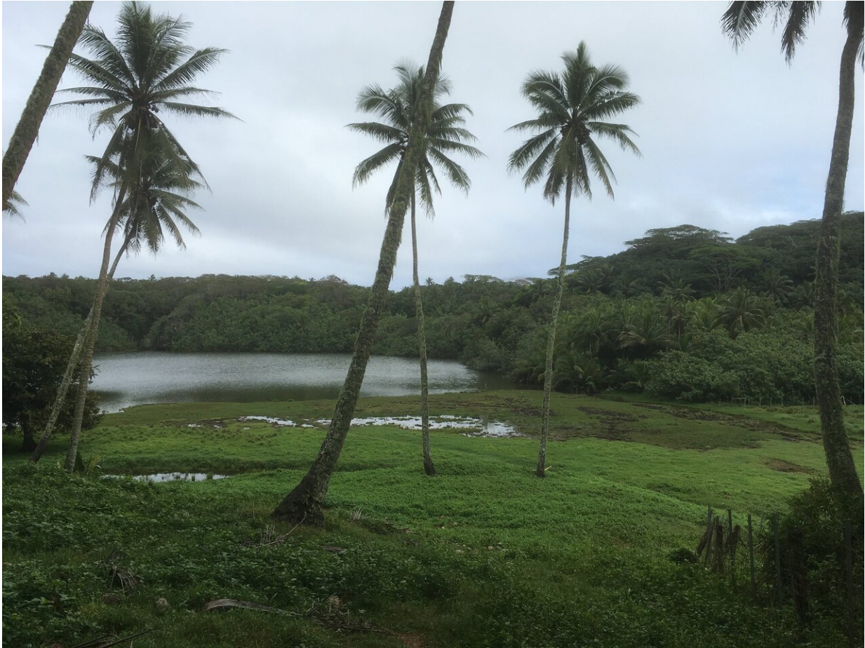
Lake Te Roto on Atiu where evidence was found of the arrival of early humans.

A team of geographers, archaeologists and geochemists from the UK, New Zealand and the US, worked with the people of Atiu, to collect core samples of lake mud, charting over 6000 years of history. Back in the labs in UK and US, the mud samples were subjected to a range of analyses including new techniques for reconstructing precipitation, and detecting the presence of mammalian faeces.