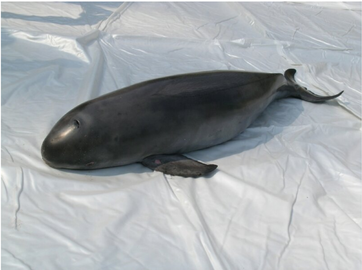
The body of a stranded finless porpoise ( Neophocaena phocaenoides).