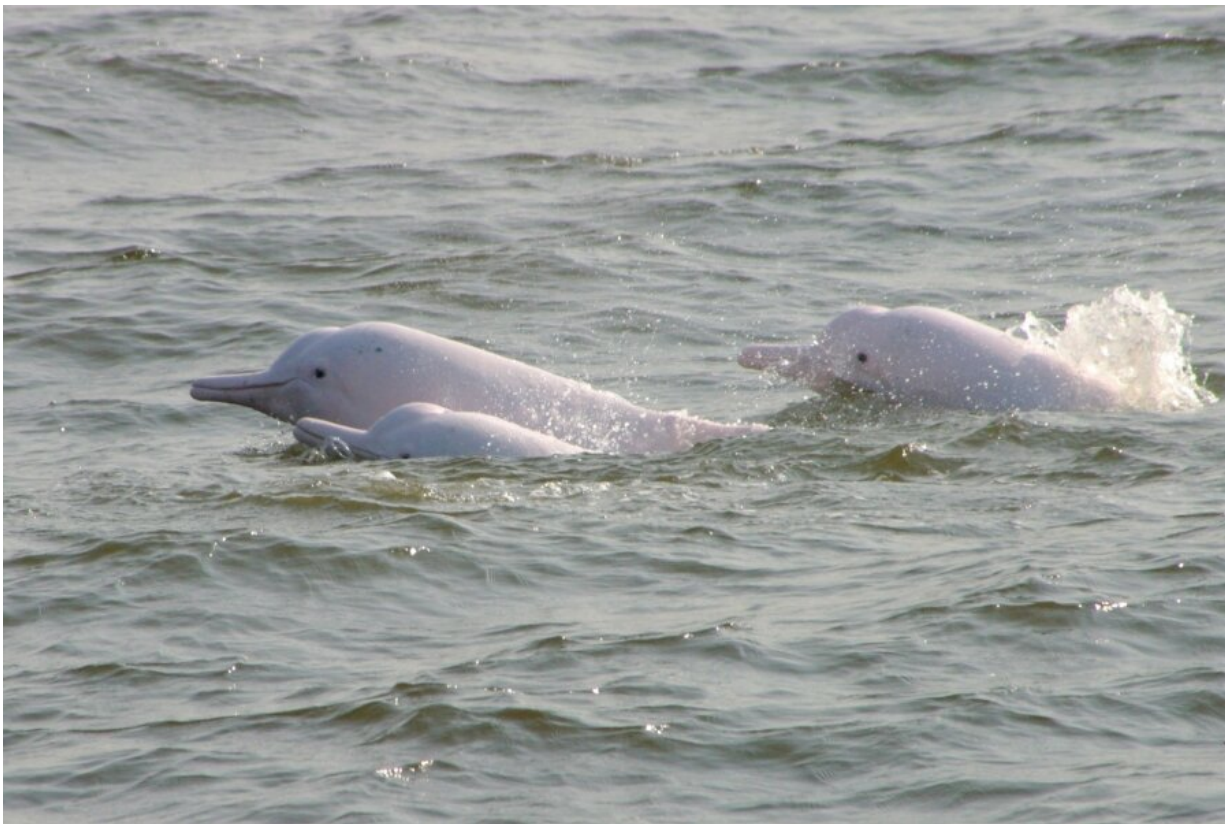
Chinese white dolphins ( Sousa chinensis ).