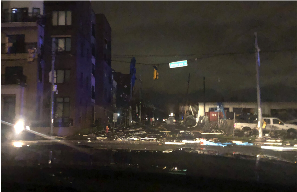
Debris is scattered across an intersection after a tornado touched down Tuesday, March 3, 2020, in downtown Nashville, Tenn.