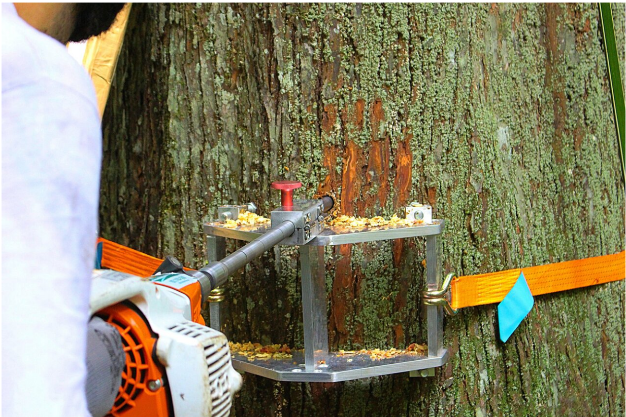
Researchers sampling a Brazil nut tree in Tapirapé-Aquiri National Forest.

Europe driving deforestation and tropical resource exploitation as they do to this day. Understanding how different societies, economic systems, and administrative organizations changed tropical forests is essential if we are to properly develop sustainable conservation policies.