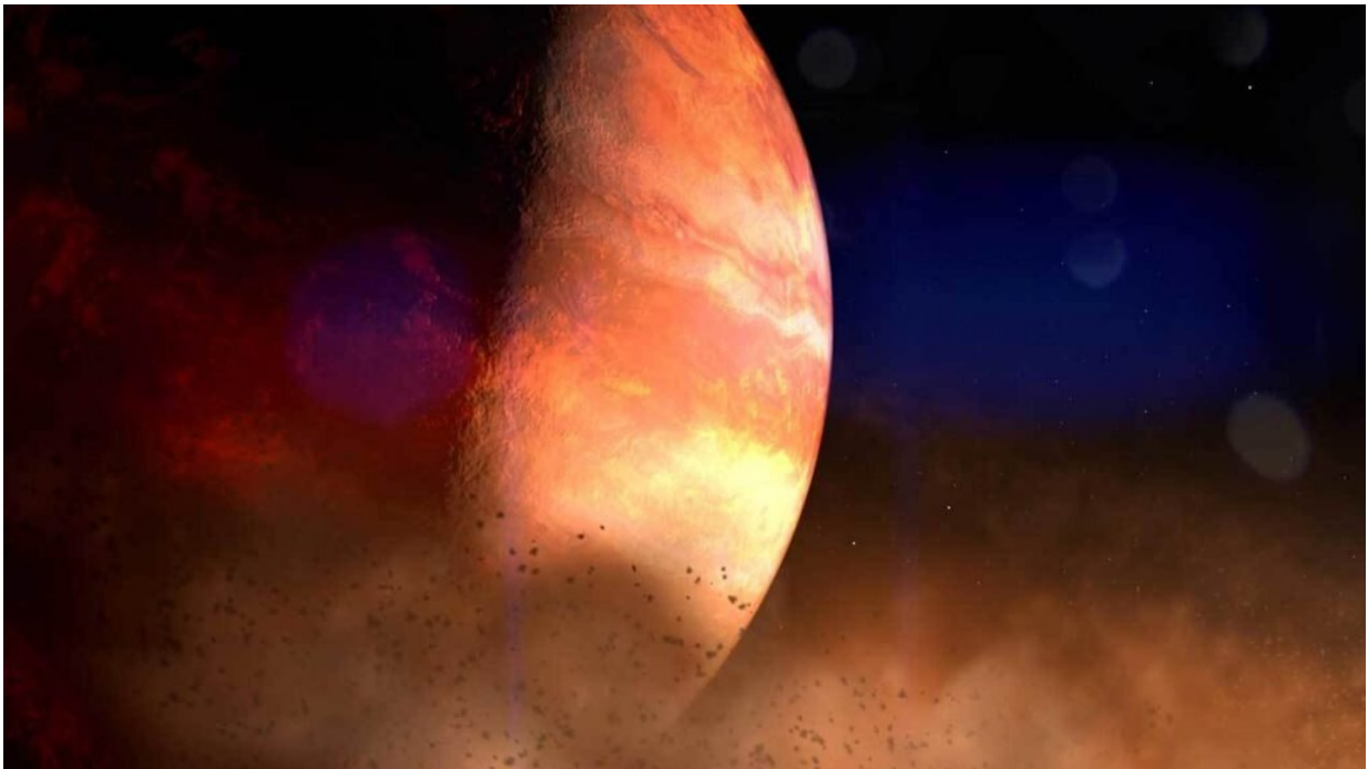
Illustration of an exoplanet.

In a generic brick building on the northwestern edge of NASA's Goddard Space Flight Center campus in Greenbelt, Maryland, thousands of computers packed in racks the size of vending machines hum in a deafening chorus of data crunching. Day and night, they spit out 7 quadrillion calculations per second. These machines collectively are