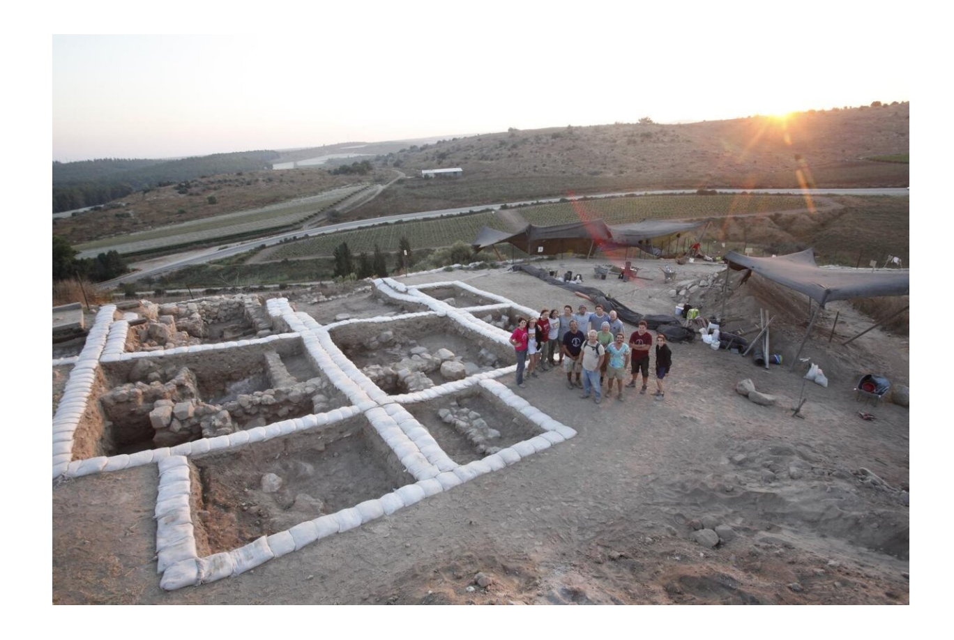
Canaanite Temple at Tel Lachish.

The layout of the temple is similar to other Canaanite temples in northern Israel, among them Nablus, Megiddo and Hazor. The front of the compound is marked by two columns and two towers leading to a large hall. The inner sanctum has four supporting columns and several unhewn "standing stones" that may have served as representations of temple gods. The Lachish temple is more square in shape and has several side rooms, typical of later temples including Solomon's Temple.