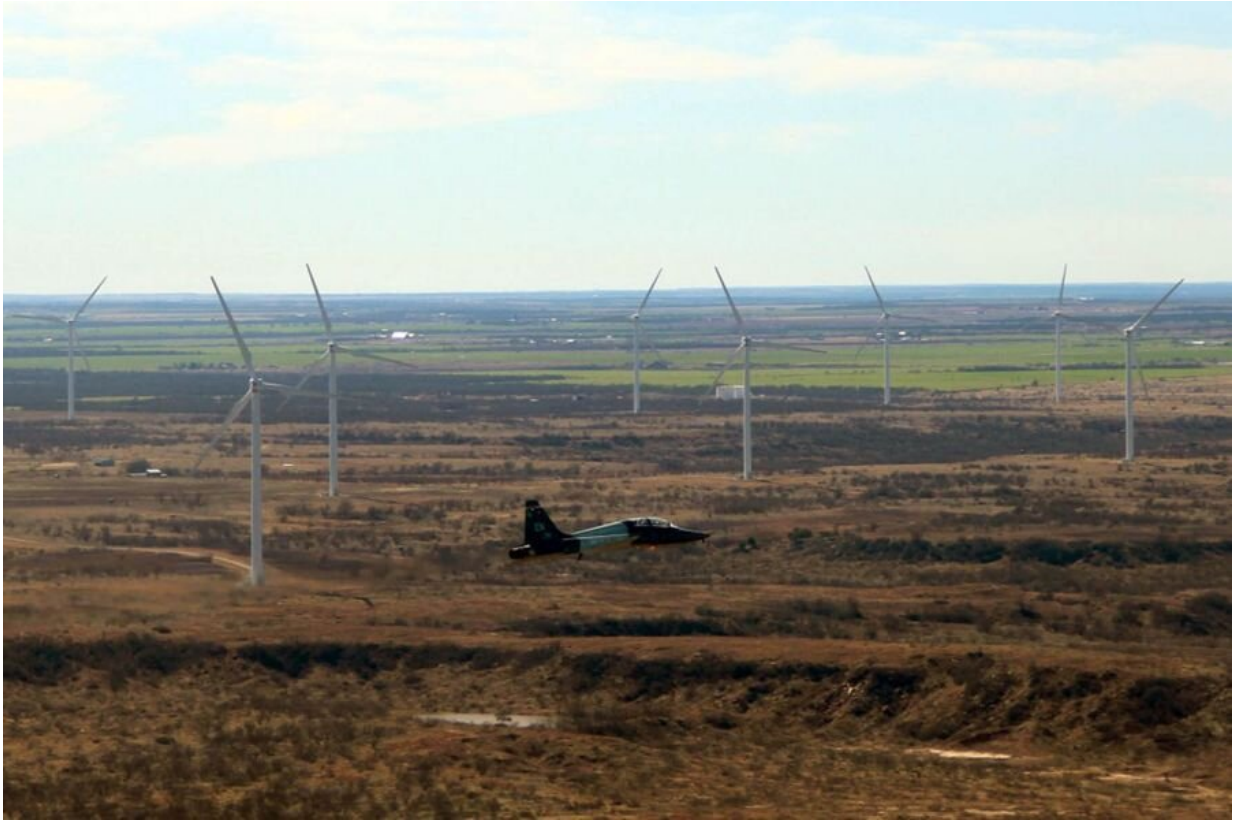
A jet flies near wind turbines in West Texas.

"NRI's technical expert, retired Navy Captain Tony Parisi, led the effort to update and expand on the institute's 2010 Wind Energy and Military Airspace in Texas report, which described the status of wind energy development in the state and its proximity to military aviation facilities," Lopez said. "The updated report captures current wind energy development in Texas and describes early notification areas based on radar line-of-sight or proposed location within particular low-level airspace or within certain proximity to military installations."