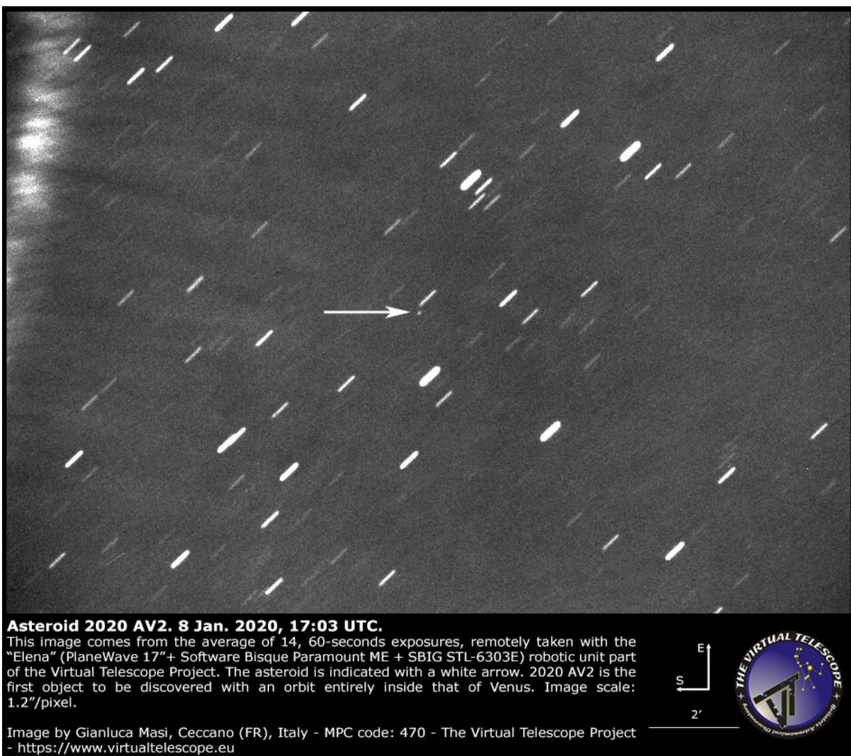
Asteroid 2020 AV2: 8 Jan. 2020.