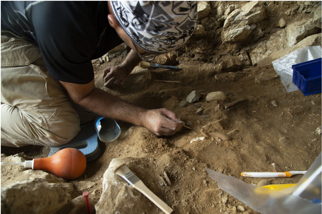
Excavation of archaeological deposits in Chagyrskaya Cave.