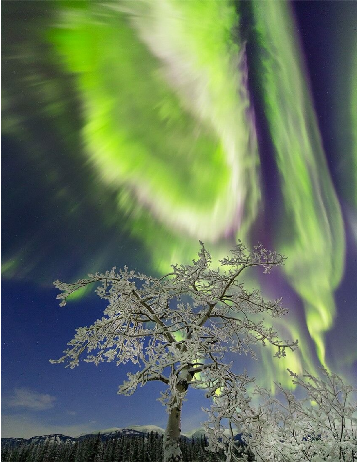
Brilliant aurora borealis is captured over Yukon, Canada, during a geomagnetic