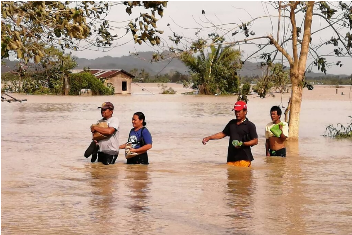
Residents wade through a highway flooded by typhoon Phanfone in Ormoc City, Leyte province

"I don't know when I will be able to go home."