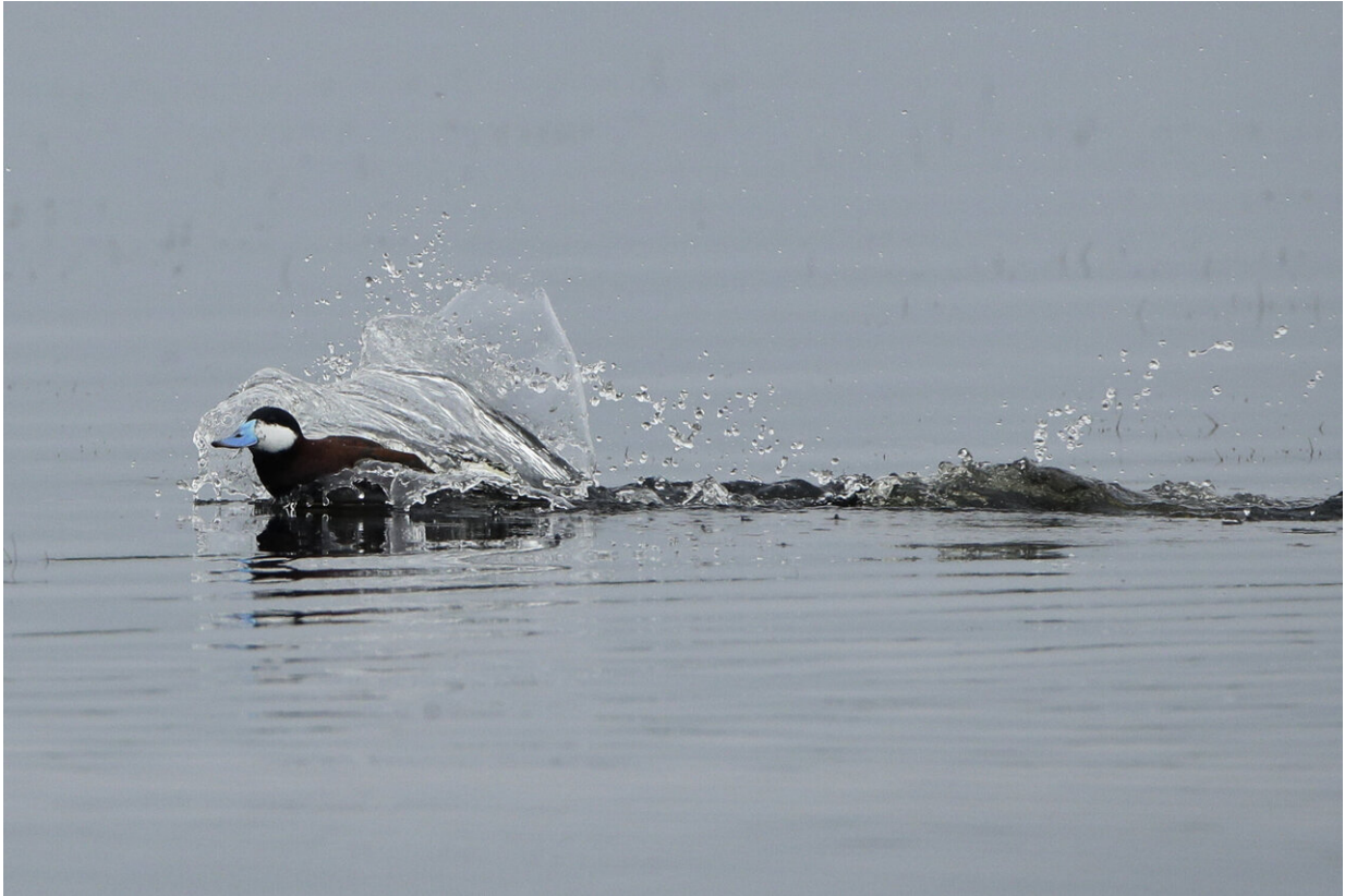
A ruddy duck drake performs a courtship display on a wetland near Sterling, N.D., on Friday, June 21, 2019.