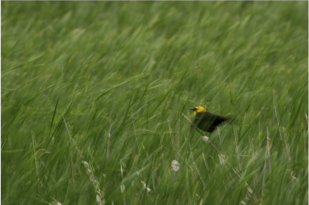
A yellow-headed blackbird perches a stalk of grass in a wetland near Sterling, N.D., on Friday, June 21, 2019.