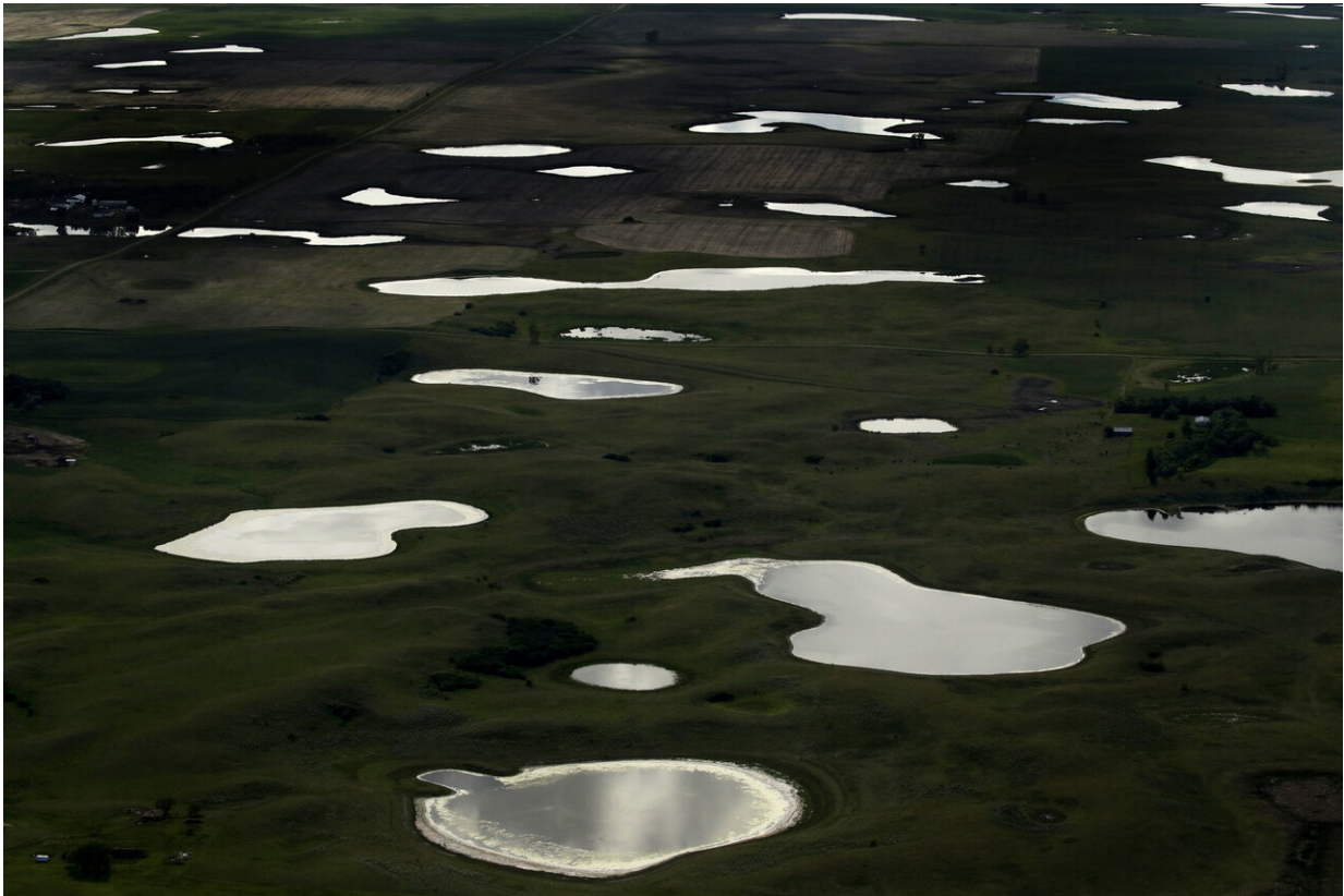
Prairie potholes dot the landscape in east central North Dakota on Thursday, June 20, 2019. The rain pools in shallow depressions and quickly flushes out insects from beneath the soil.