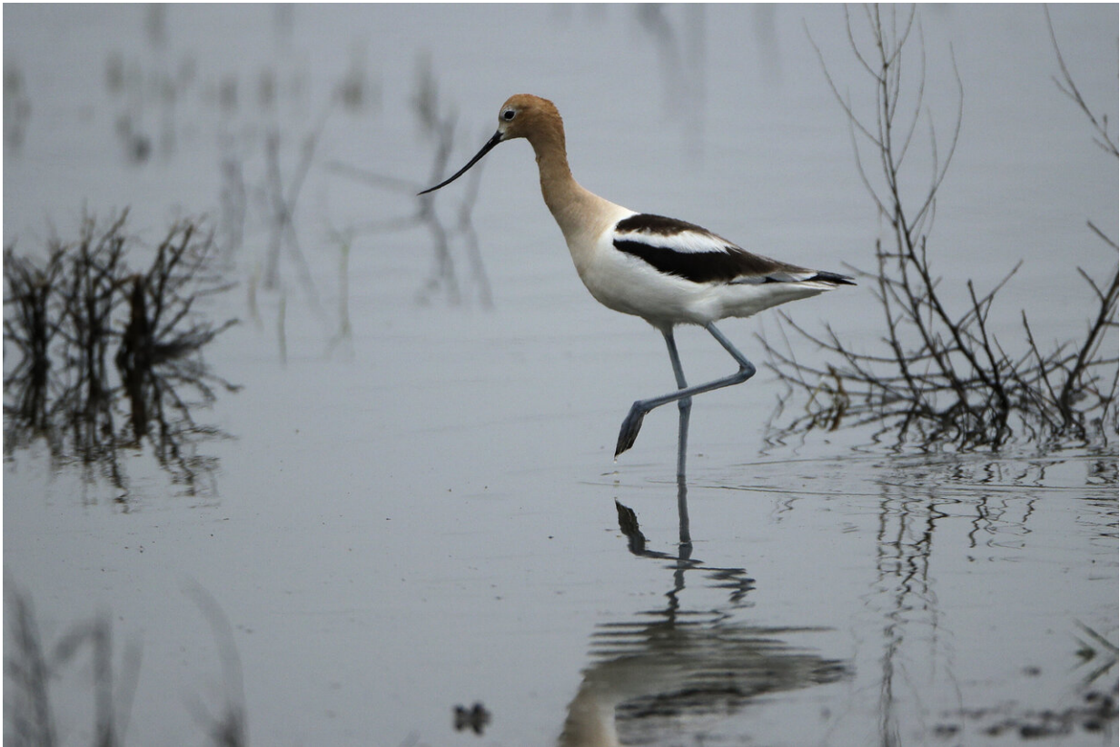
An American avocet searches for food in a wetland near Sterling, N.D., on Friday, June 21, 2019.