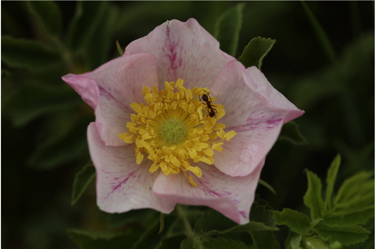
An ant crawls on a Prairie Rose in grassland adjacent to a restored wetland near Sterling, N.D., on Friday, June 21, 2019.