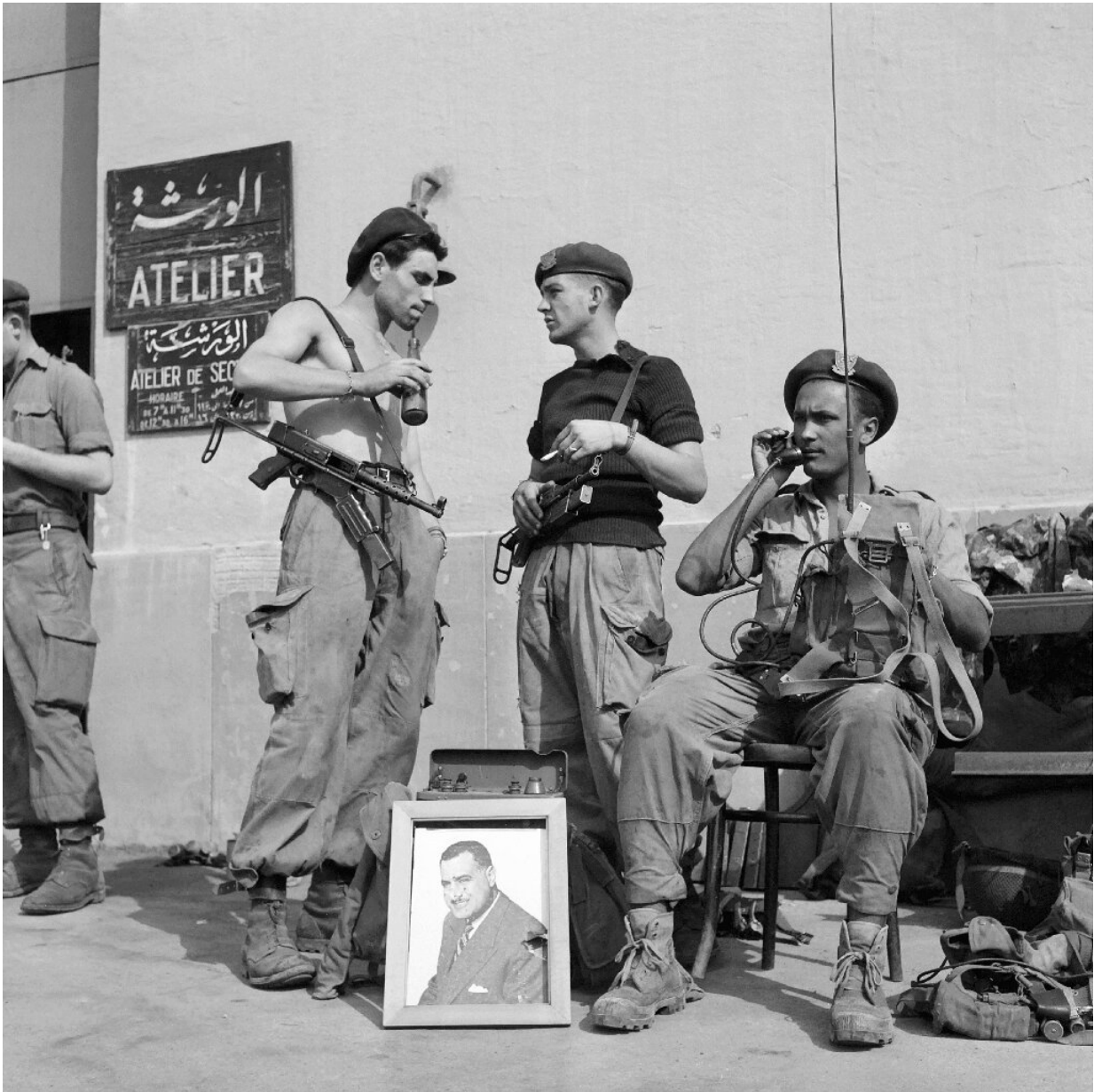
A file photo from November 1, 1956 shows Egyptian soldiers with a portrait of then president Gamal Abdel Nasser in Port Said at the height of the Suez canal crisis, after Nasser nationalised the key waterway

Dug in the 19th century using "rudimentary tools", today the waterway has become "a lifeline to Egypt," Osama Rabie, head of the authority