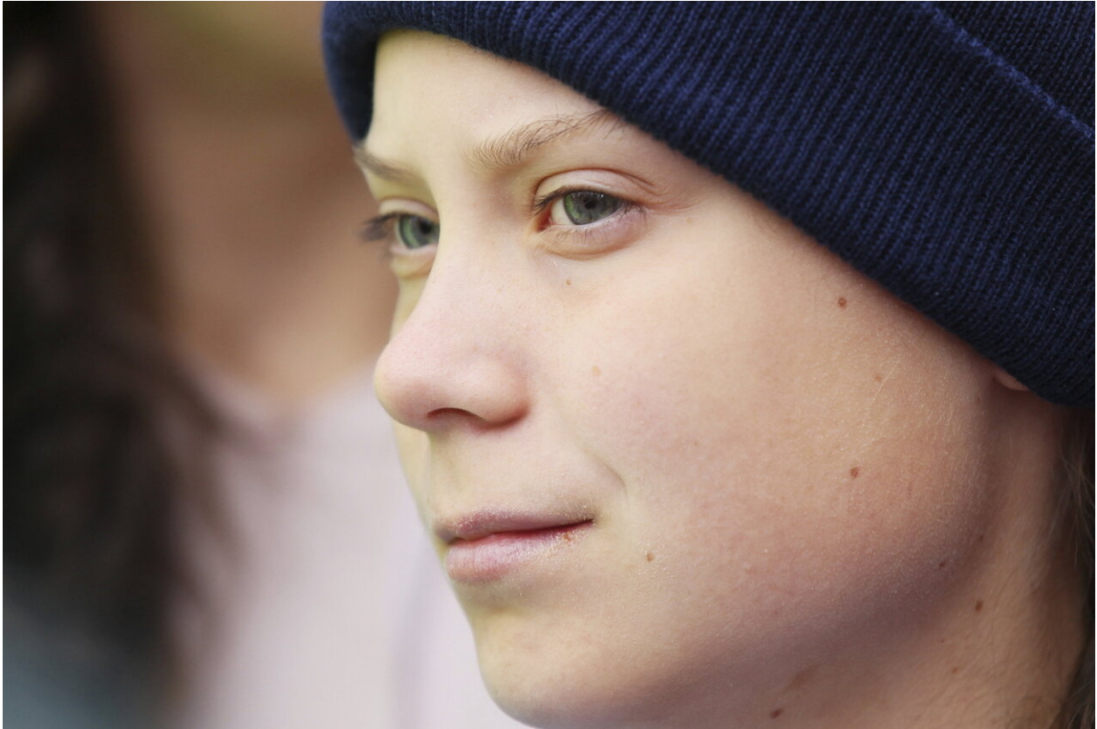
Swedish climate activist Greta Thunberg takes part in a march and rally at the Alberta Legislature Building in Edmonton, Alberta, on Friday, Oct. 18, 2019.