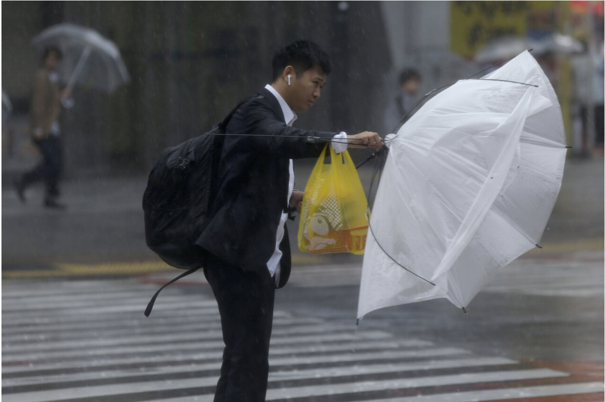
A man struggles with his umbrella against strong wind at a crossing in Shibuya district, Tokyo Saturday, Oct. 12, 2019. Tokyo and surrounding areas braced for a powerful typhoon forecast as the worst in six decades, with streets and trains stations unusually quiet Saturday as rain poured over the city.