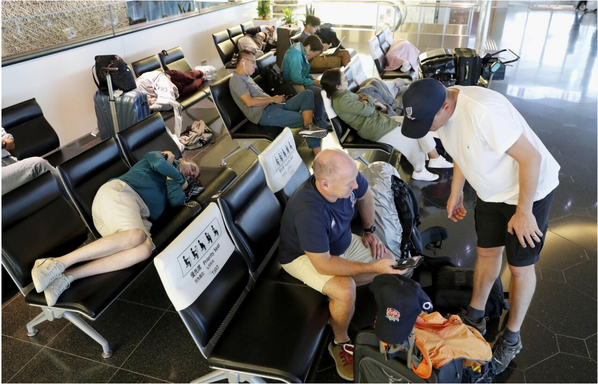
Passengers, including a British man who came for the Rugby World Cup, rest and wait for their flights which were cancelled because of Typhoon Hagibis, at Haneda Airport in Tokyo, Saturday, Oct. 12, 2019. Tokyo and surrounding areas braced for a powerful typhoon forecast as the worst in six decades, with streets and trains stations unusually quiet Saturday as rain poured over the city.