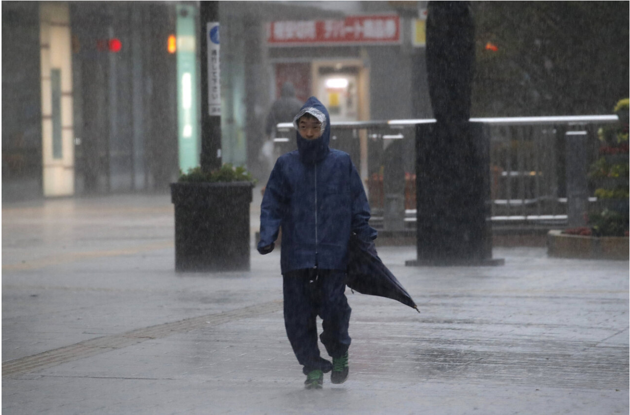
A man walks in heavy rain in Hamamatsu, central Japan, Saturday, Oct. 12, 2019. A heavy downpour and strong winds pounded Tokyo and surrounding areas on Saturday as a powerful typhoon forecast as the worst in six decades approached landfall, with streets and train stations deserted and shops shuttered.