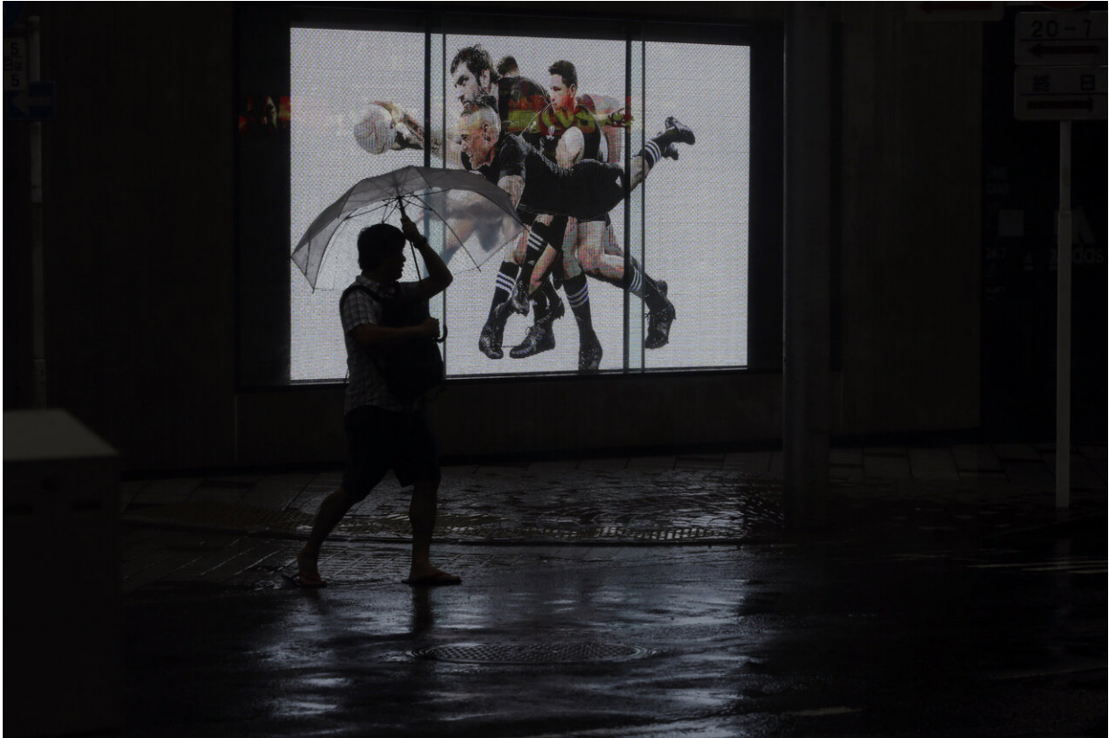
A man walks in rain in Shibuya district, Tokyo Saturday, Oct. 12, 2019. Tokyo as surrounding areas braced for a powerful typhoon forecast as the worst in six decades, with streets and trains stations unusually quiet Saturday as rain poured over the city.