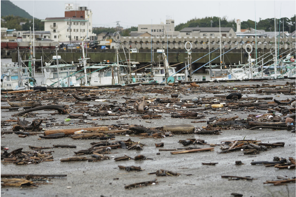
Sea wracks land at a port as Typhoon Hagibis approaches in town of Kiho, Mie prefecture, central Japan Saturday, Oct. 12, 2019. Tokyo and surrounding areas braced for a powerful typhoon forecast as the worst in six decades, with streets and trains stations unusually quiet Saturday as rain poured over the city.