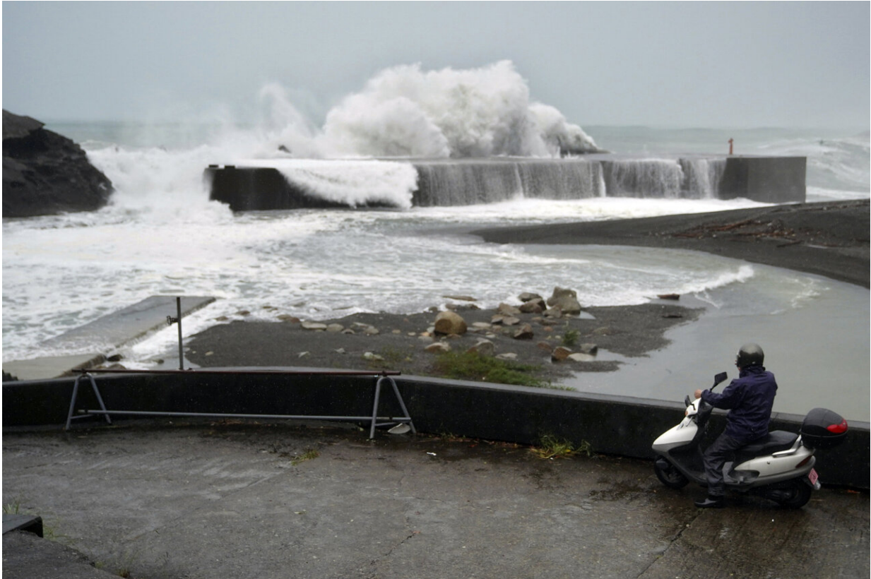
A man on a scooter watches as surging waves hit against the breakwater as Typhoon Hagibis approaches a port in Kumano, Mie Prefecture, Japan, Saturday, Oct. 12, 2019.