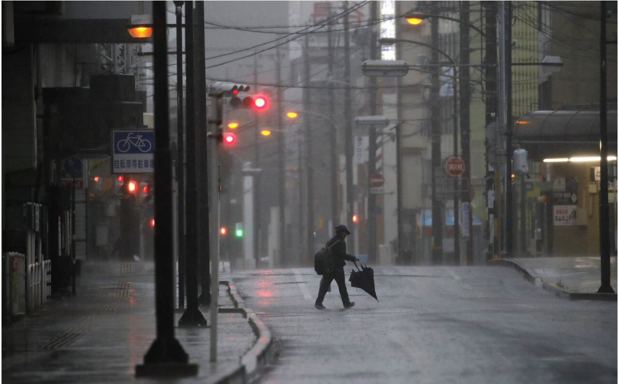
A woman crosses the road in Hamamatsu, central Japan, Saturday, Oct. 12, 2019. A heavy downpour and strong winds pounded Tokyo and surrounding areas on Saturday as a powerful typhoon forecast as the worst in six decades approached landfall, with streets and train stations deserted and shops shuttered.