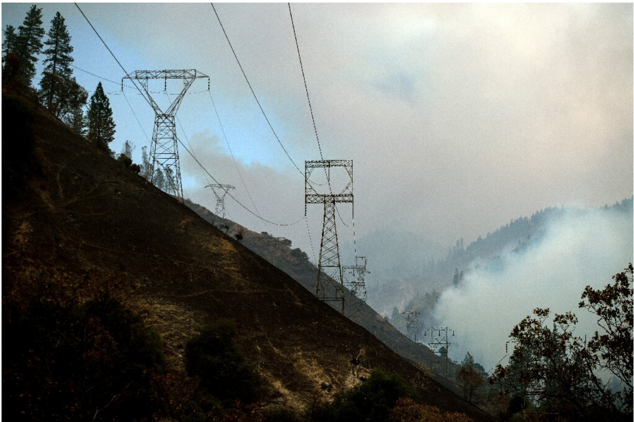
Power lines are seen on November 11, 2018 against a smoky landscape near Pulga, California, east of Paradise, California

Schools and universities closed Wednesday and people stocked up on gasoline, water, batteries and other basics.