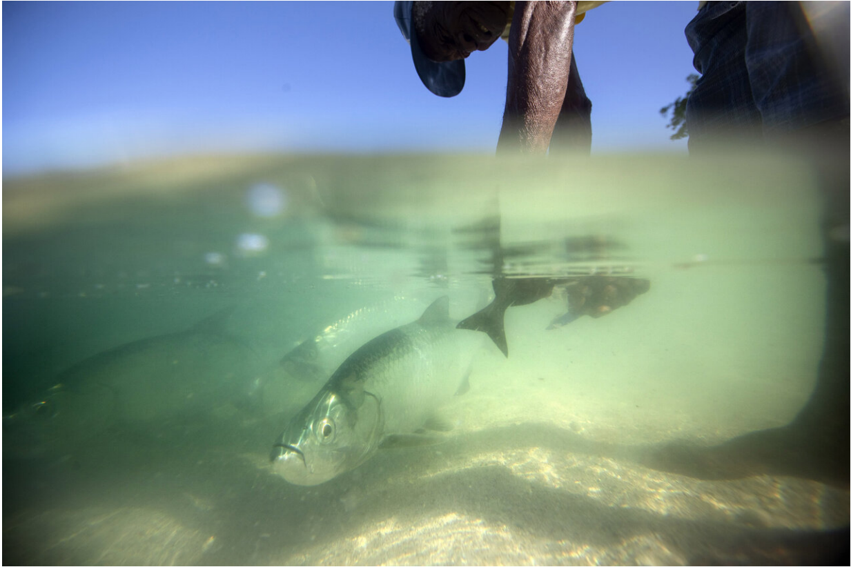
Fisherman Oswald Coombs is encircled by tarpon as he cleans his catch on the beach in the fishing village of Oracabessa Bay, Jamaica, Wednesday, Feb. 13, 2019. With fish and coral, it's a codependent relationship, the fish rely upon the reef structure to evade danger and lay eggs, and they also eat up the coral's rivals.