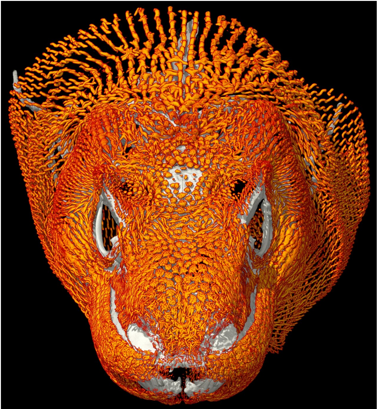
Bony plates called osteoderms (colored orange) cover the skull of an adult Komodo dragon.