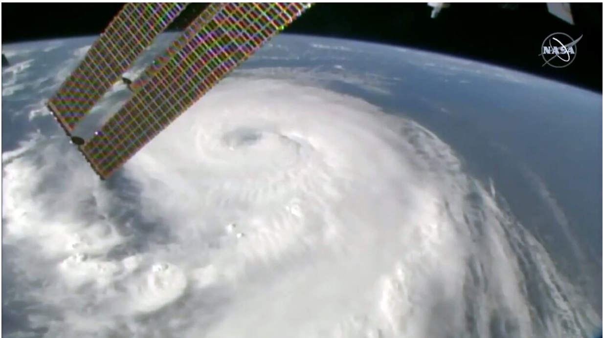
Hurricane Dorian as viewed from the International Space Station

As rescue efforts ramped up, Dorian was expected to continue approaching the coast of South Carolina this morning, before moving near or over the coast of North Carolina tonight the NHC said in its 0200 (0600 GMT) bulletin.