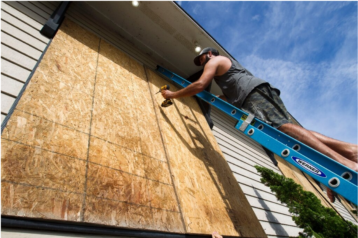
Tayler Hofe boards up the windows of a surf shop in Avon, North Carolina, as Hurricane Dorian approaches