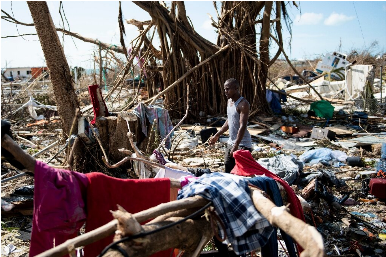
A man walks past damage caused by Hurricane Dorian in Marsh Harbour, Great Abaco Island in the Bahamas

The center of the storm was expected to move to southeast New England Friday night and Saturday morning, and then across Nova Scotia late Saturday.