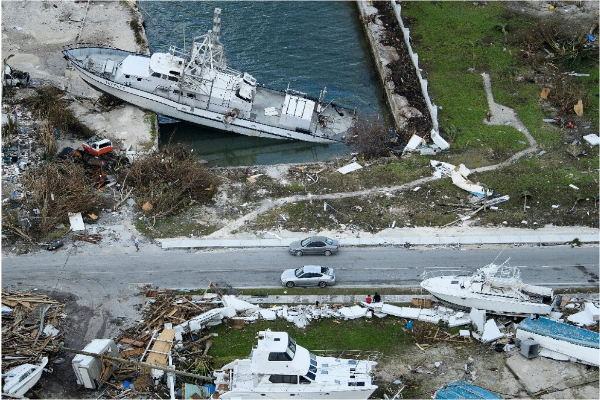
An aerial view of damage from Hurricane Dorian in Marsh Harbour, Great Abaco Island in the Bahamas